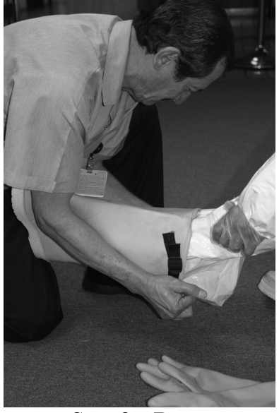
Step 3 – Boots