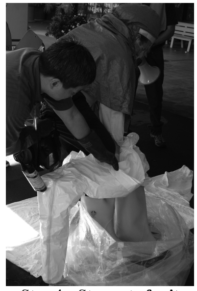
Step 4 – Step out of suit Assistant helps push suit down from the inside to the level of the boots. Suited First Receiver steps out of the suit, away from the shower area towards the clean zone.