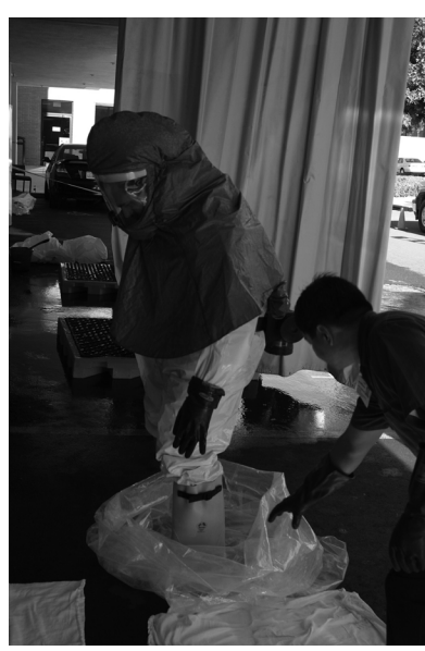
Step 1 – Stand in bag