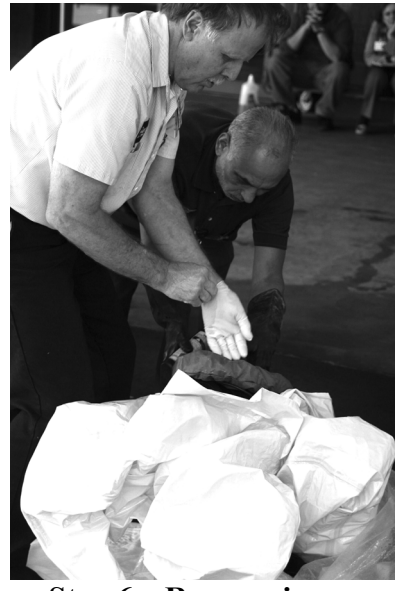
Step 6 – Remove inner gloves

Step 5 – Remove hood From the outside, remove the hood keeping hands away from face. Drop in bag.