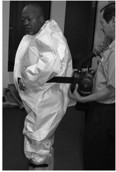
Step 4 – PAPR belt Don the respirator belt or vest. Don the battery and turn it on.