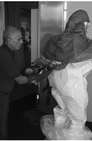
Step 3 – Remove PAPR Assistant holds PAPR while the suited First Receiver first unclips the belt then unzips the suit.