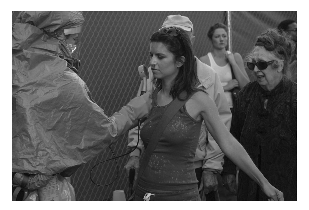
Module One Introduction to Weapons of Mass Destruction

Weapons of Mass Destruction (WMD) are devices, usually chemical, biological, explosive, or radiological in nature, that are intended to cause death or serious bodily injury to a large number of people. In the hands of terrorists, WMDs are likely to be particularly deadly.