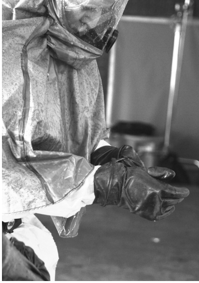
Step 2 – Remove outer gloves Both gloves should be removed simultaneously to avoid contaminating inner gloves. Pull fingers half way, then let drop into bag.