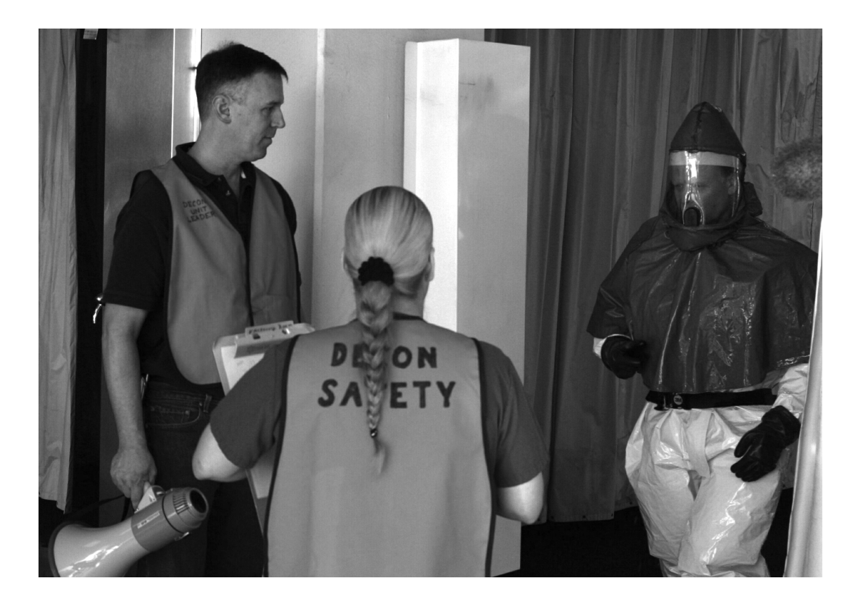
Module Two Hospital Incident Command System

A terrorist incident, flood, earthquake or other incident with mass casualties will overwhelm any community, especially the hospitals. Therefore, it is important for hospitals to develop a plan to work together and with local government agencies to meet the challenge of this type of situation.