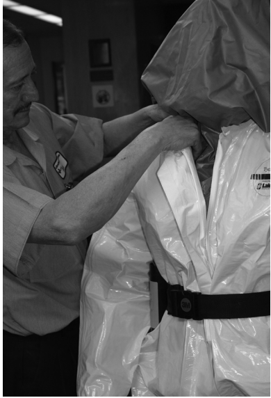
Step 5 – Hood inside suit Zip the suit to the neck with the outer collar draped over the shoulders. Seal the adhesive strip over the zipper.