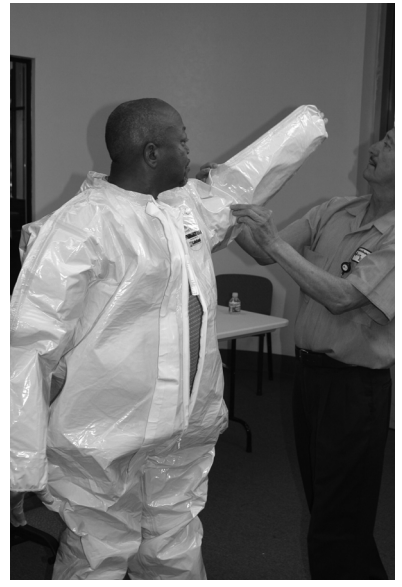
Step 2 – Suit The suit is donned and zipped to the Don the chemical-protective boots. level just above the beltline.