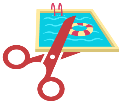
Extended Pool Hours