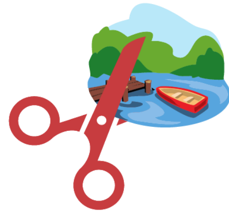
Regional Parks and Lakes