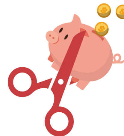
DCBA Financial Empowerment