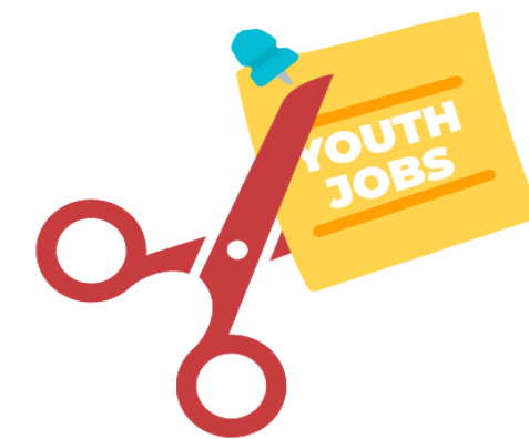
Youth Jobs and Internships