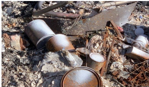
Examples of hazardous materials that will be removed.