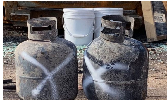
Empty containers EPA inspects will be marked with a white X, made safe, and left to be removed during Phase 2.