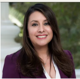
LUZ RIVAS* CONGRESS, 29TH DISTRICT