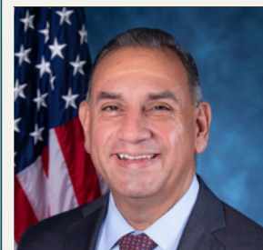
GIL CISNEROS CONGRESS, 31ST DISTRICT