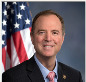
ADAM SCHIFF* U.S. SENATE