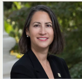
LAURA FRIEDMAN* CONGRESS, 30TH DISTRICT