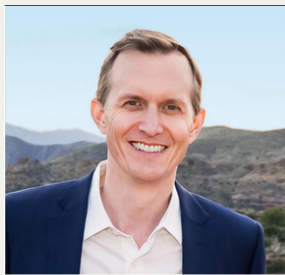
GEORGE WHITESIDES CONGRESS, 27TH DISTRICT