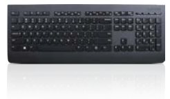
Lenovo Professional Wireless Keyboard

*Based on Google Chrome Power_LoadTest, a battery run down test. For more information about Google Chrome Power_LoadTest, visit www.chromium.org . Test results should be used only to compare one product with another and are not a guarantee you will experience the same battery life. Battery life may be significantly less than the test results and varies depending on your product's configuration, software, usage, operating conditions, power management settings and other factors. Maximum battery life will decrease with time and use.