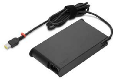
Slim ThinkPad 230W AC Adapter