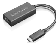
USB-C to HDMI Adapter