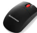
Lenovo Laser Wireless Mouse