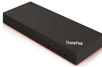
ThinkPad® Thunderbolt™ 3 Workstation Dock Gen 2