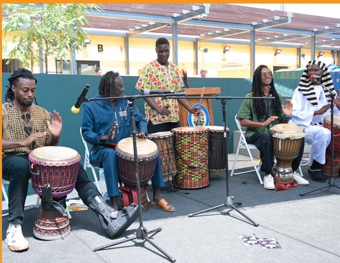
The SRCC Grand Opening included local artists and entertainers, here, the Skid Row Drummers are providing their signature beats for guests.