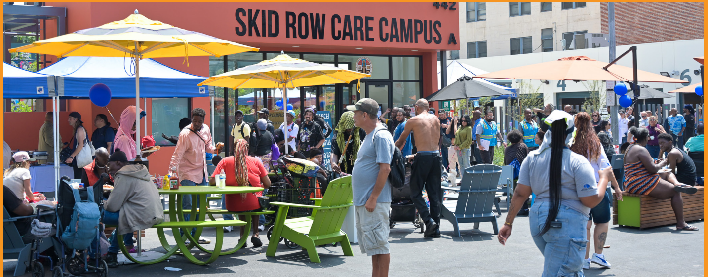
SRCC Grand Opening guests in line and ready to enjoy the BBQ that was served for the celebration.