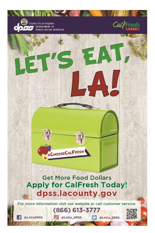
Poster B (General Population) - Let's Eat LA! <u>Download</u>