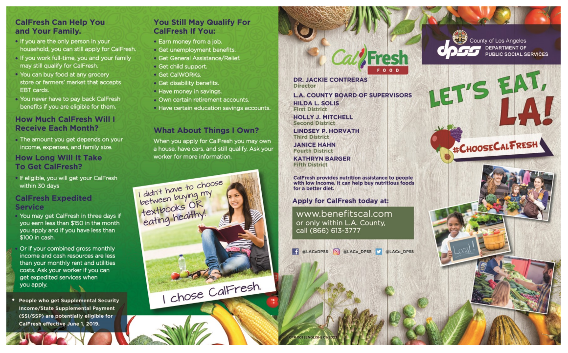
CalFresh - Let's Eat LA! (Side 1)

This informative brochure provides a brief overview of CalFresh eligibility, ways to apply for CalFresh benefits, as well as the various DPSS social media accounts if the customer wishes to learn more about the program. The brochure can be accessed by clicking the download link below for your organization to print and use.