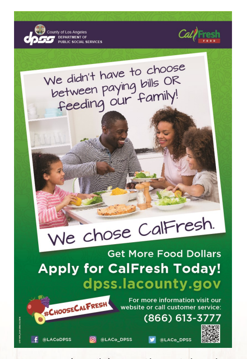
Poster D (Family) - We Chose CalFresh. <u>Download</u>