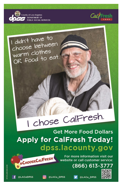
Poster F (Homeless) - I Chose CalFresh. <u>Download</u>