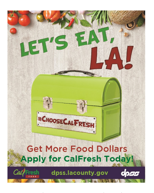
Graphic B (General Population) - Let's Eat LA! <u>Download</u>