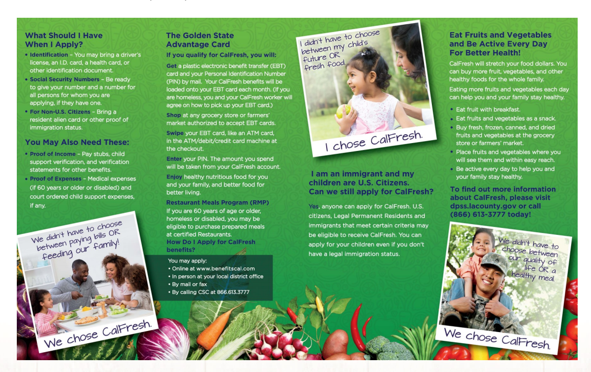
Brochure - Let's Eat LA! (Side 2)