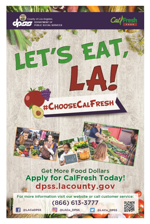
Poster A (General Population) - Let's Eat LA! <u>Download</u>

These printable 11" x 17" posters can be displayed throughout your organization where customers are primarily serviced; to educate them about the CalFresh Program in Los Angeles County, and the various social media accounts they can access to obtain more information from DPSS.