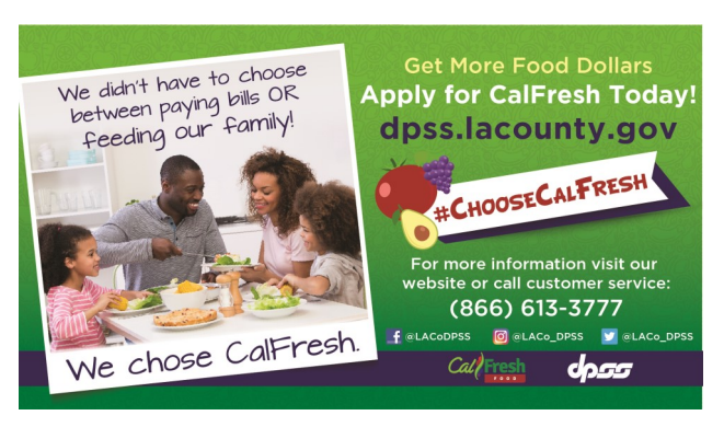
Web Slider C (Family) - We Chose CalFresh.