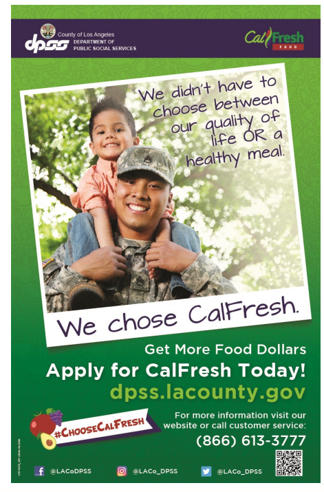
Poster H (Veteran) - We Chose CalFresh. <u>Download</u>