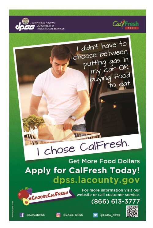
Poster J (Millennials) - I Chose CalFresh.