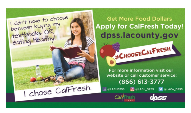
Web Slider B (Student) - I Chose CalFresh.