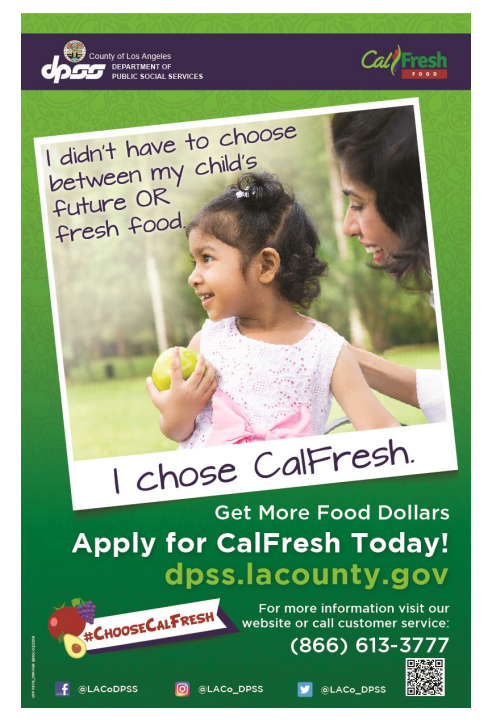
Poster E (Family) - I Chose CalFresh. <u>Download</u>