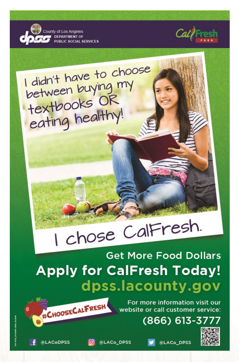
Poster C (Student) - I Chose CalFresh.