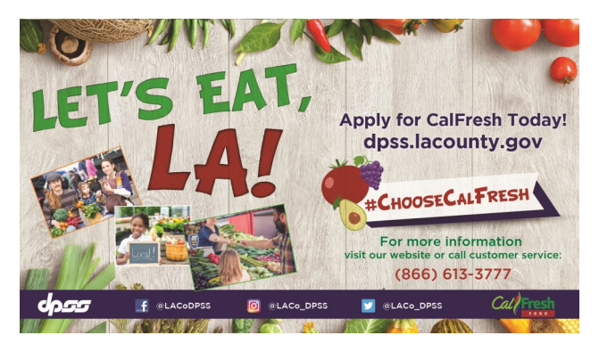
Web Slider A (General Population) - Let's Eat LA! <u>Download</u>

These CalFresh Lobby TV Monitor Graphics can be downloaded and displayed on any TV, especially those found in lobbies or areas where your customers are waiting to be serviced. These graphics inform viewers about the CalFresh Program in Los Angeles County, and the various social media sites they can access to learn more about the program, and obtain the latest information.