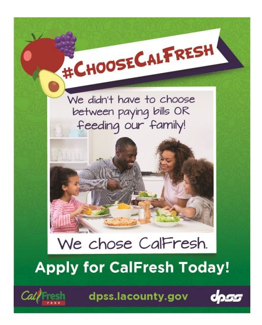
Graphic D (Family) - We Chose CalFresh. <u>Download</u>