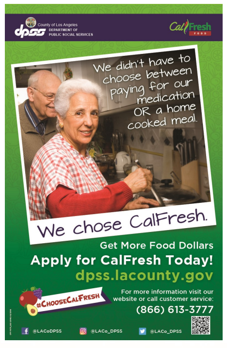
Poster G (Elderly) - We Chose CalFresh. <u>Download</u>