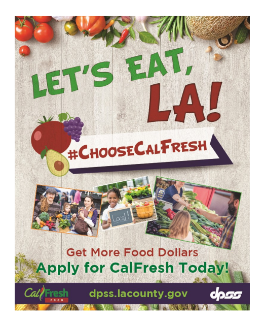
Graphic A (General Population) - Let's Eat LA! <u>Download</u>

These web graphics* can be used to enhance your social media posts and capture the attention of your audiences to inform them about the CalFresh Program in Los Angeles County.