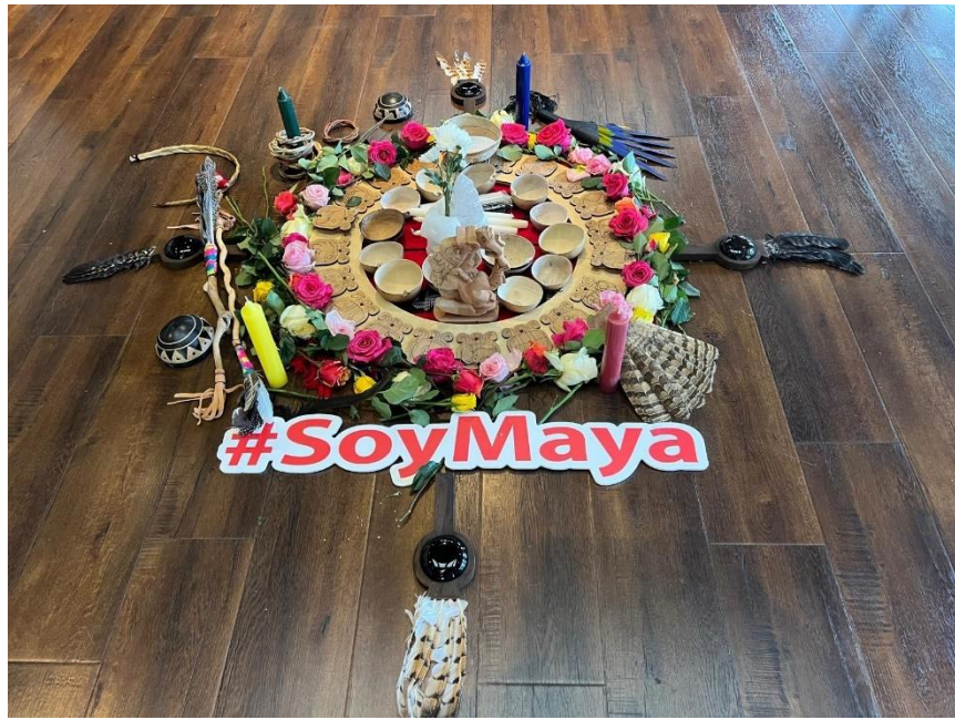
Elements of Altar