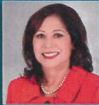
Hilda L. Solis First District