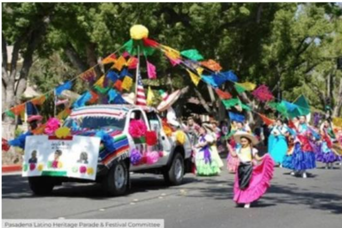
Pasadena Latino Heritage Parade & Festival Committee

National Hispanic Heritage Month honors the culture, heritage, and contributions of Hispanic Americans each year. The event began in 1968 when Congress deemed the week including September 15 and 16 National Hispanic Heritage Week to celebrate the contributions and achievements of the diverse cultures within the Hispanic community.