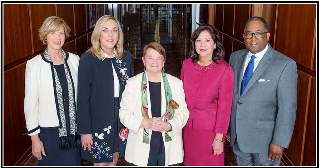
Janice Hahn ~ Kathryn Barger ~ Sheila Kuehl ~ Hilda L. Solis ~ Mark Ridley-Thomas