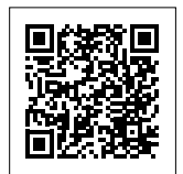
SCAN THIS QR CODE TO WATCH A VIDEO.

Before annual benefits enrollment begins on October 1, it's a good idea to make sure you can access the benefits website. Log in to mylacountybenefits.com with your username and password. If you've forgotten them, click the Forgot My Username or Forgot My Password link on the login page.