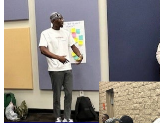
October Orientation Series Part 1