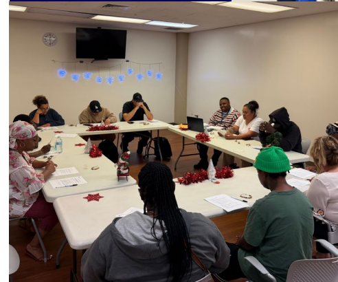
December Holiday Gathering Meet & Greet