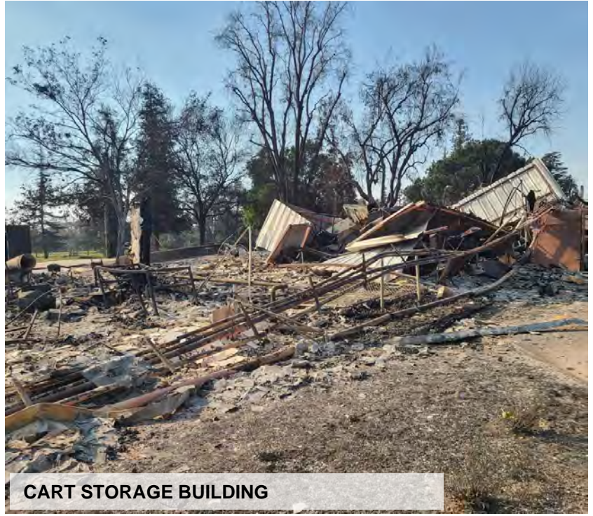
CART STORAGE BUILDING