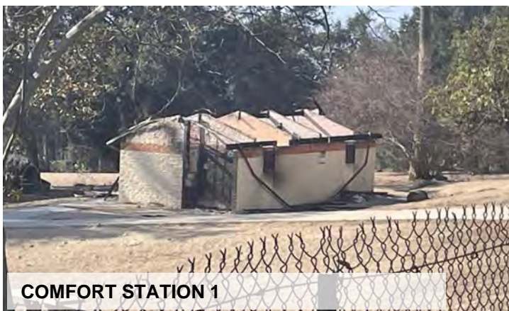
COMFORT STATION 1