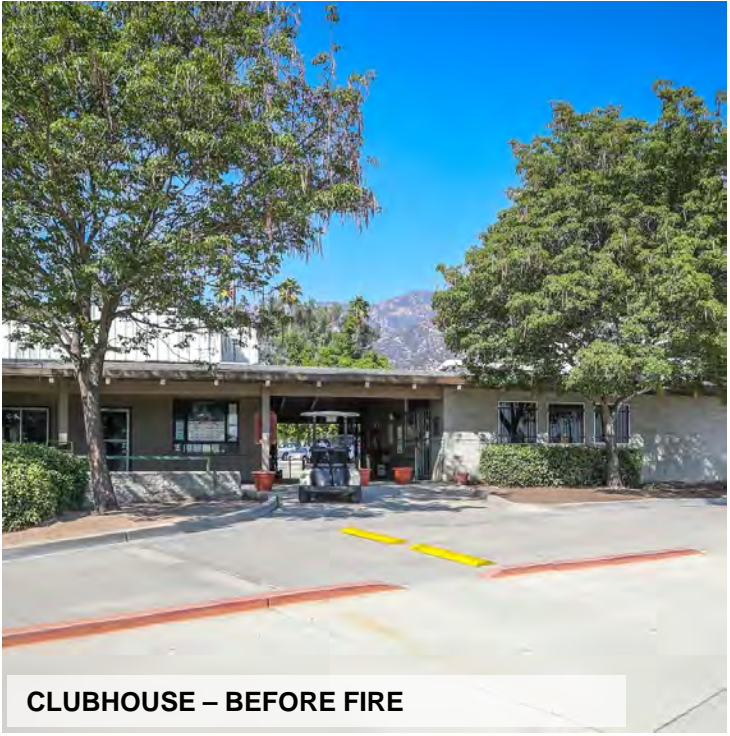
CLUBHOUSE – BEFORE FIRE