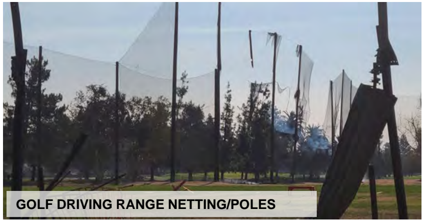
GOLF DRIVING RANGE NETTING/POLES