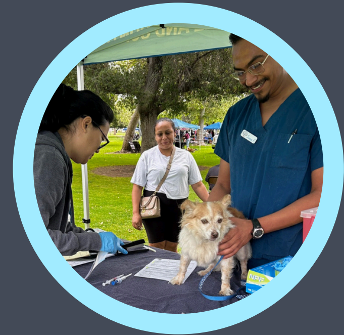
Sustaining Pets Are Family (PAF) Programs