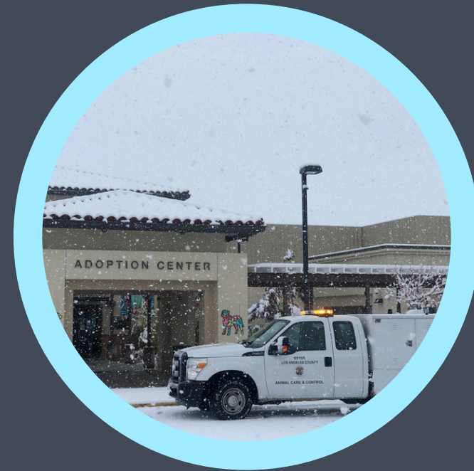
Request for Information (RFI) for Additional Animal Housing