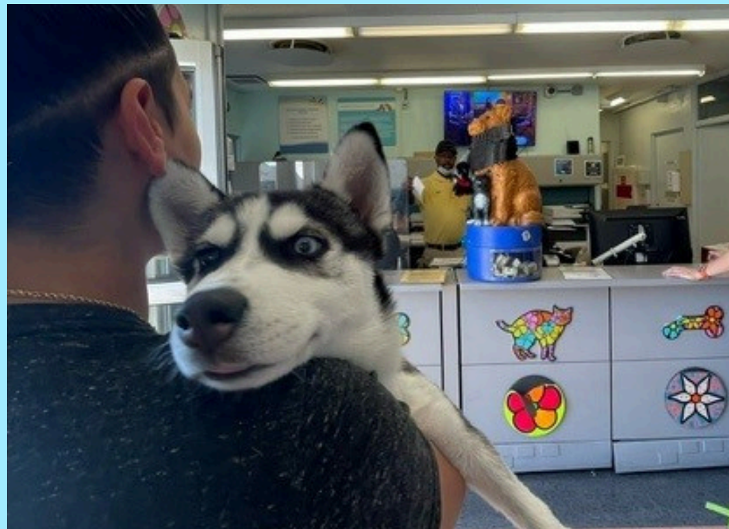
Increase in pet surrenders and stray animals