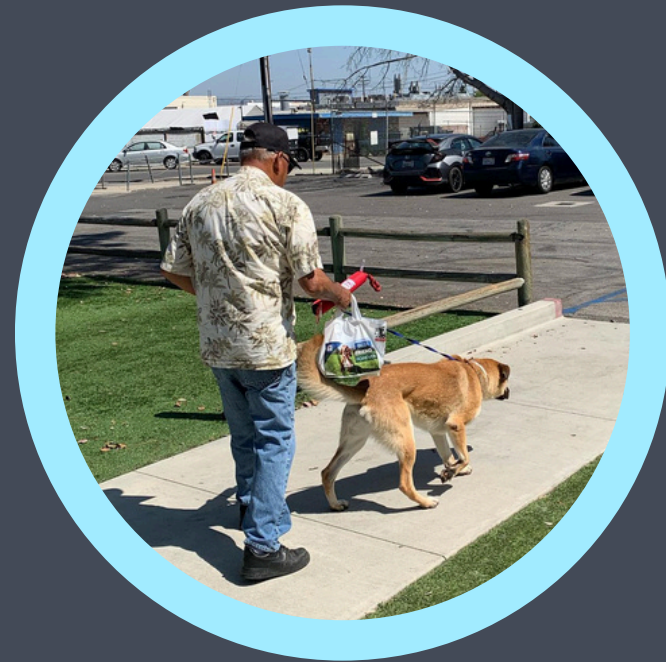
Intervention Specialist Pilot Position