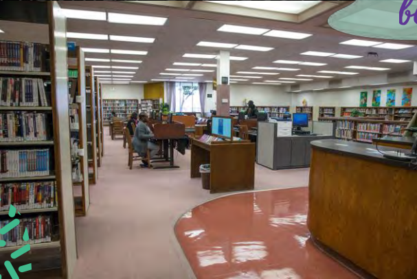
Masao W. Satow Library 2 nd District