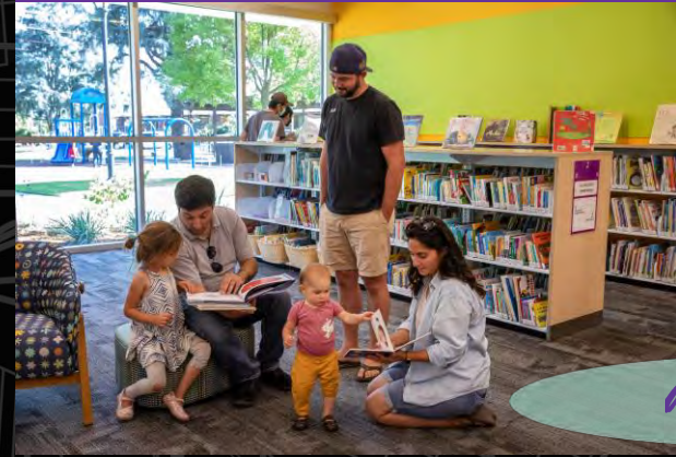
Temple City Library 5th District