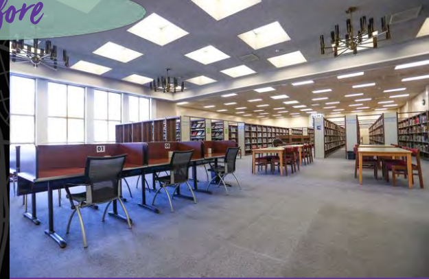
Norwalk Library 4 th District