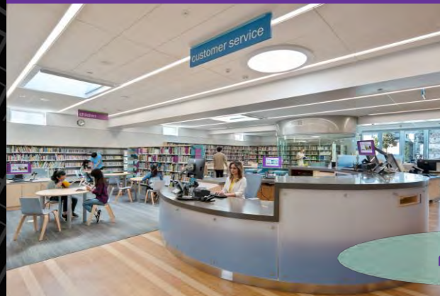
Live Oak Library 5th District