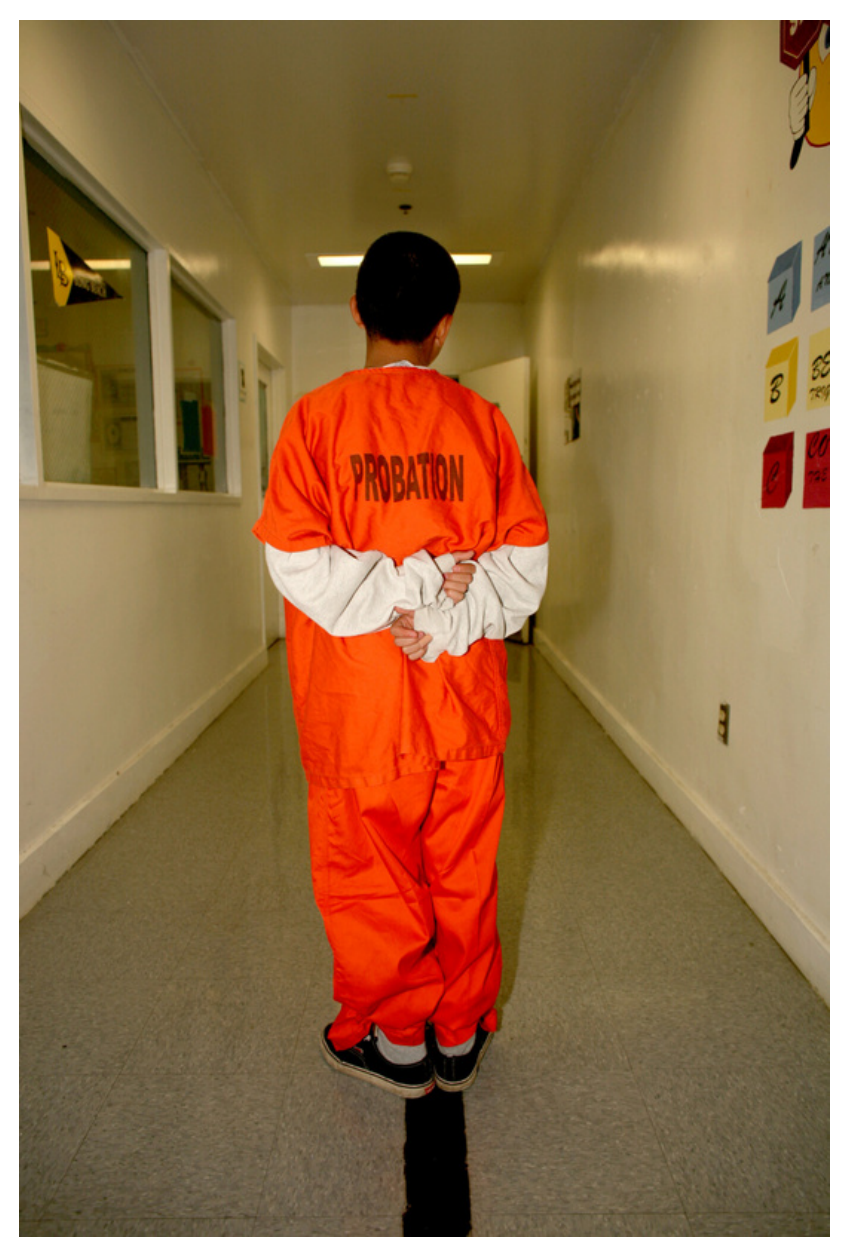
A boy is dressed for a court appearance. Photo not taken during inspections.

Oleoresin Capsicum spray – Probation leadership committed publicly to reopening Los Padrinos Juvenile Hall without Oleoresin Capsicum (OC) spray. Less than a month after opening, OC spray was reintroduced at the facility, including in units housing girls, gender expansive youth, and youth with diagnosed developmental disabilities. While OC spray was available to staff at Barry J. Nidorf SYTF, use of the spray plummeted in the months prior to the inspection. There was no phase out plan in place at either facility.