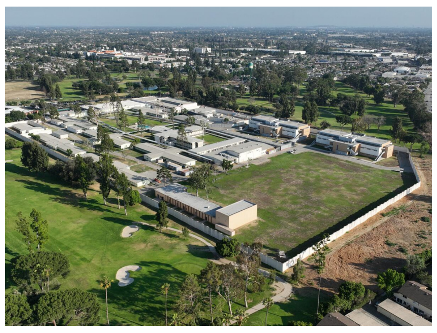
Aerial view of Los Padrinos Juvenile Hall in Downey.

This inspection was conducted on June 15, 2023, prior to youth being housed at the facility. Upon entering the facility, an x-ray machine and a metal detector were observed, though not yet tended to by security. There was a staffed reception and all commissioners and POC staff were asked for identification and to sign a visitor log.