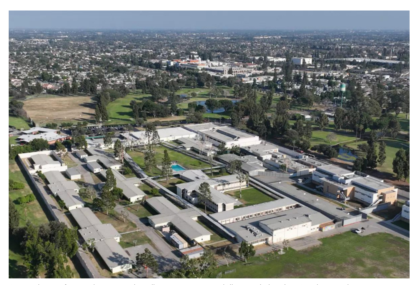
An aerial view of Los Padrinos Juvenile Hall in Downey in June.

• The first facilities inspected were Dorothy F. Kirby Center and Camp Scott which continue to be located together on a single campus in Commerce. This was followed by inspections of Camp Afflerbaugh and Camp Paige, which are located next door to one another. Next, a pre-inspection was conducted of Los Padrinos Juvenile Hall prior to its re-opening and the POC conducted a limited inspection of Central Medical Hub, located at the former Central Juvenile Hall. Next, Campus Kilpatrick, Camp Rockey, and the SYTF facility at Barry J. Nidorf Juvenile Hall were inspected. Finally, a full inspection was conducted at Los Padrinos Juvenile Hall after its re-opening which brought all pre-dispositioned youth in Los Angeles County into the facility.