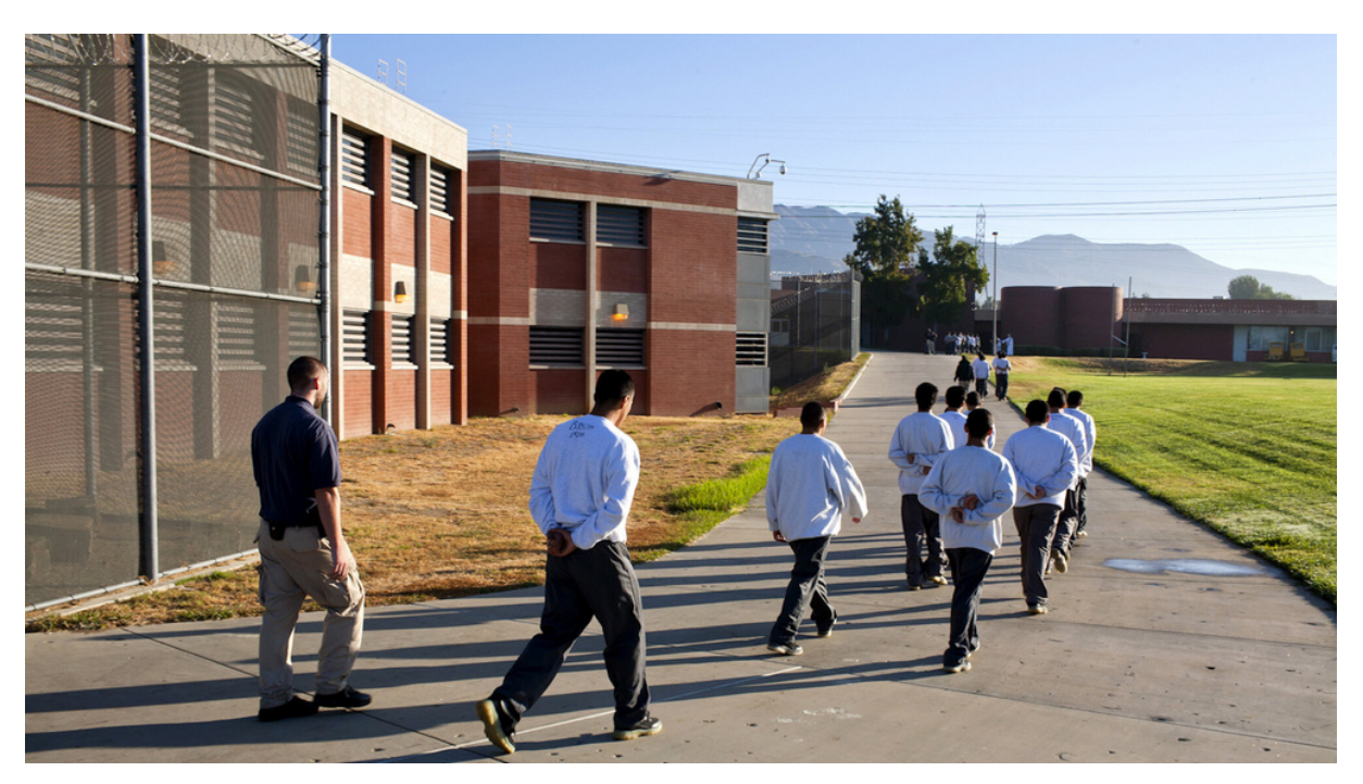
Teenagers at Barry J. Nidorf Juvenile Hall in Sylmar, Calif., in 2014.

Commissioners observed three young men in one class who informed the commissioners that they were the LACOE ambassadors because of their good work. The classroom displayed their school projects, and they informed us they had created a presentation of their work which they showed the Commissioners with pride.