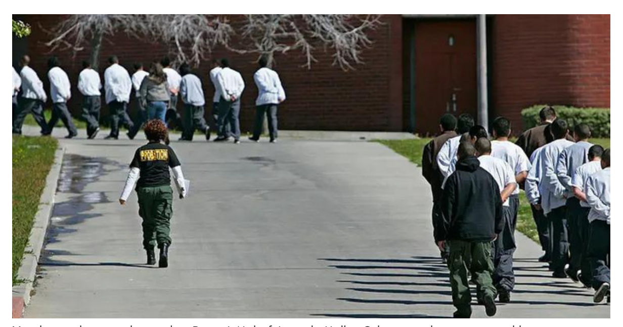
Youth matching on the yard at Barry J. Nidorf Juvenile Hall in Sylmar, as they are moved between locations. 2007.

Facility Rated Capacity: 584<sup>13</sup>