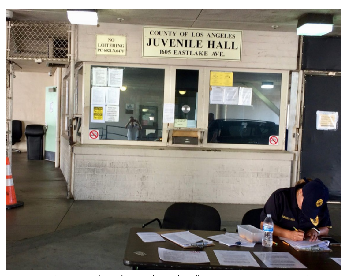
Entrance to LA County Probation's Central Juvenile Hall, Oct 1, 2017.

Inspection #5 - Central Medical Hub: 1605 Eastlake Ave, Los Angeles, CA 90033