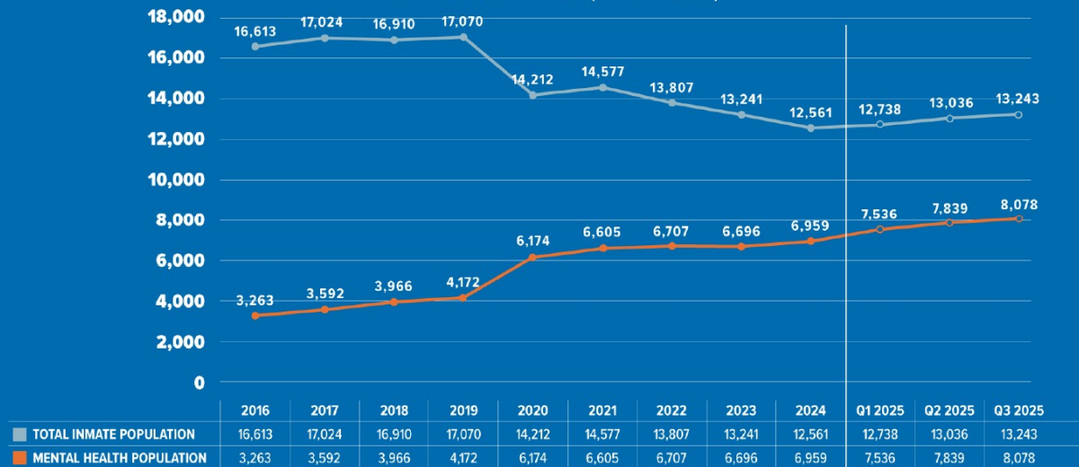
TOTAL INMATE POPULATION vs. MENTAL HEALTH POPULATION 2016–2025 (Q1–Q3)

Total Inmate Population Data Source: Average Daily Inmate Population from LASD Custody Division Reports Mental Health Population Data Source: 2016–2019 LASD MH Count, 2020–2025 P-Level Reports