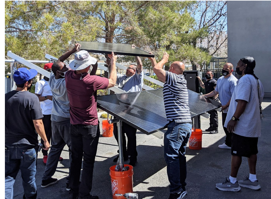
SECTOR participants in a solar panel installation training with Paving the Way, Lancaster, CA