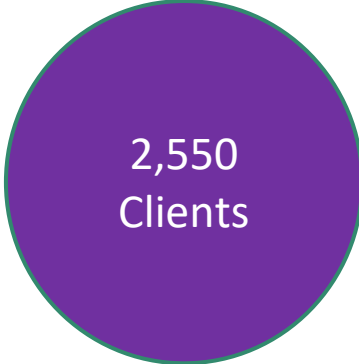
Current Program Capacity