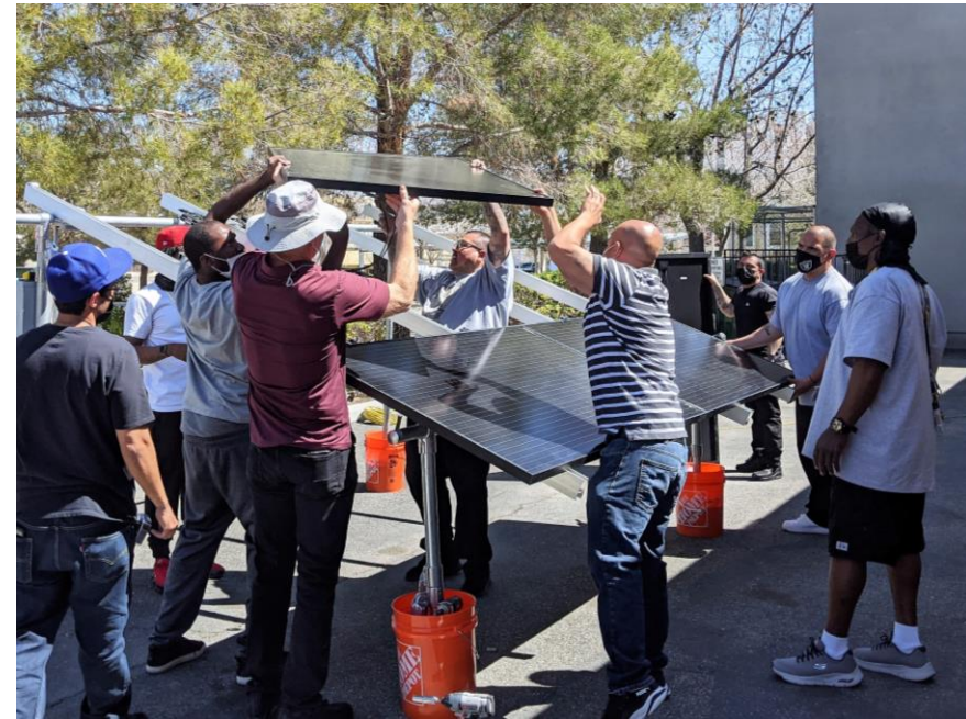
SECTOR participants in a solar panel installation training with Paving the Way, Lancaster, CA