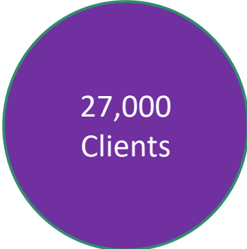
Total Clients Served to date