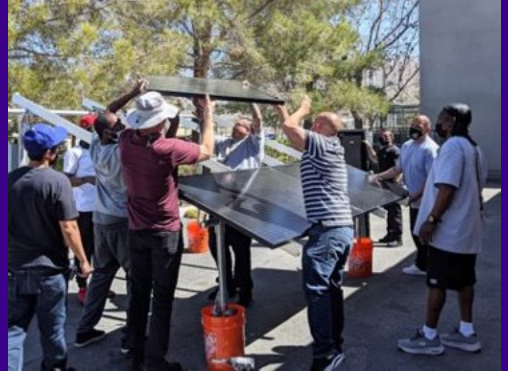
SECTOR participants in a solar panel installation training with Paving the Way, Lancaster, CA