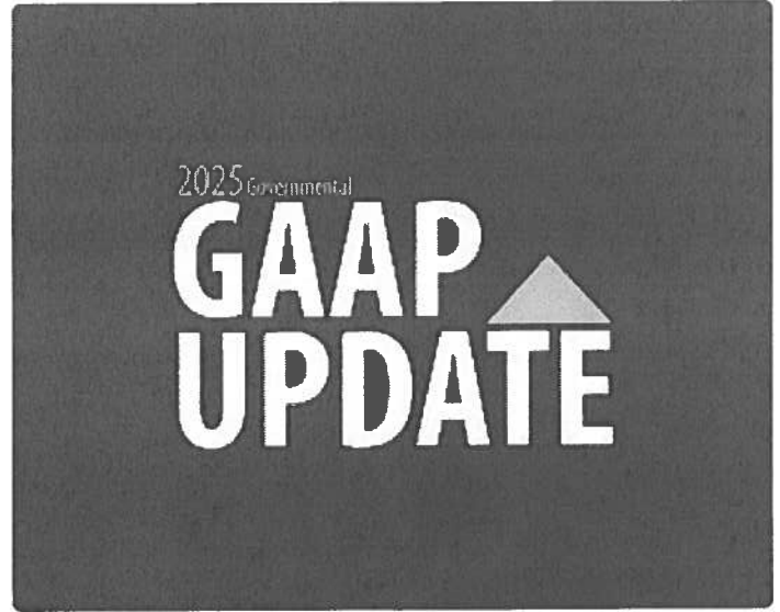
2025 Annual Governmental GAAP Update Encore