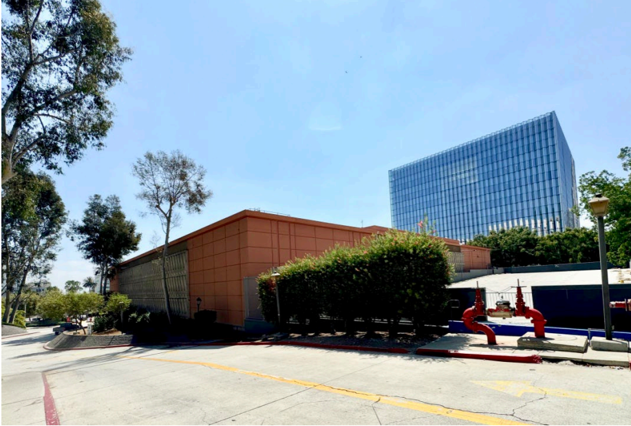
Photo 8 Library addition, view facing southwest toward decorative panels on north elevation (Civic Center Mall)