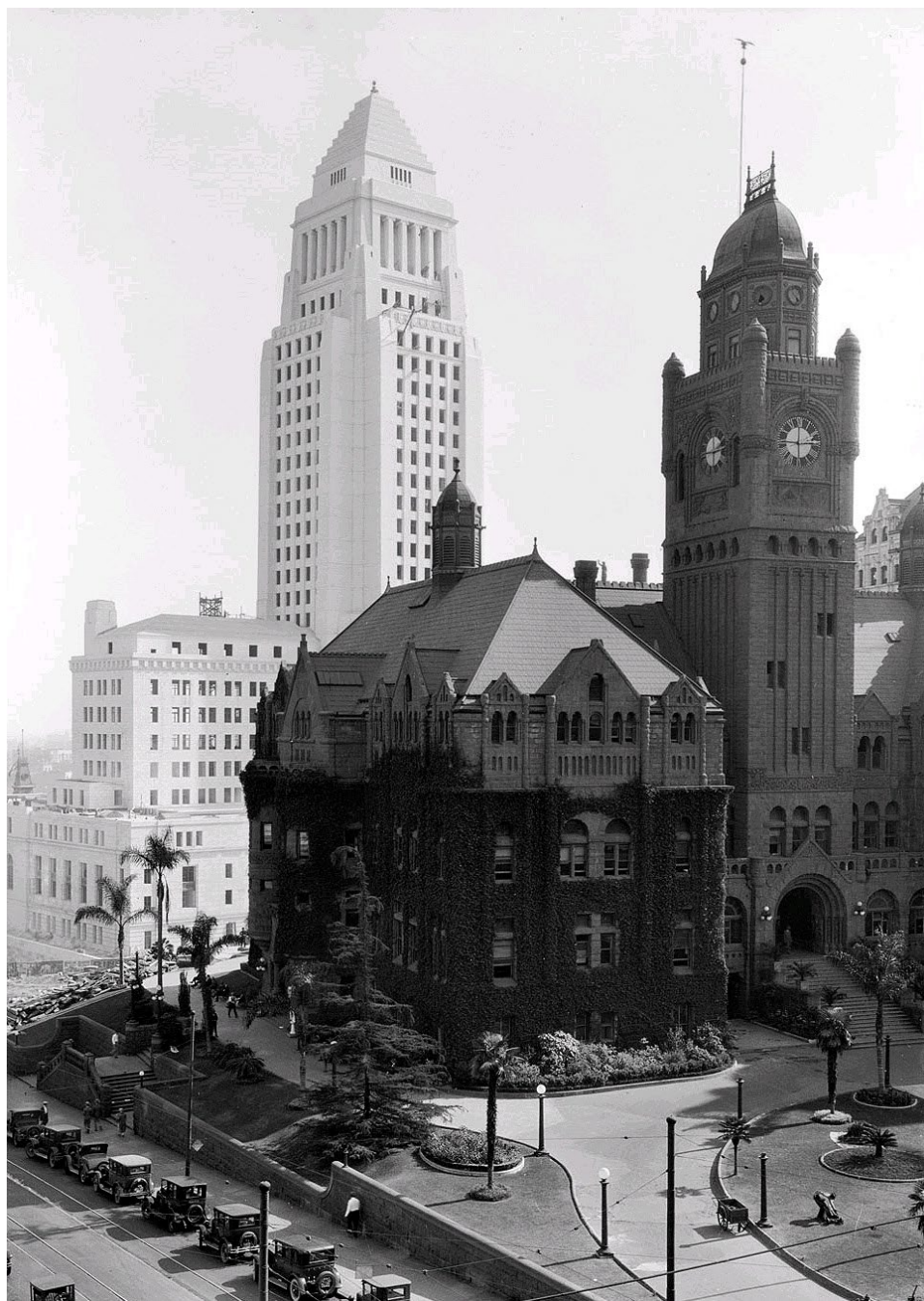
Figure 1 When was first founded, the Los Angeles County Law Library was housed in the County Courthouse. Constructed in 1891, the building was damaged in the Long Beach earthquake in 1933 and demolished in 1936. In the background, Los Angeles City Hall is still under construction, 1928.

Los Angeles, California County and State