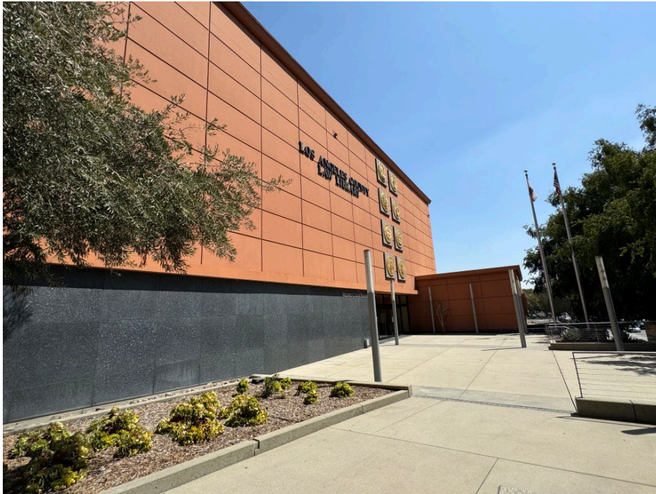
Photo 4 Library, view facing north toward main entrance on south elevation (1 st Street)