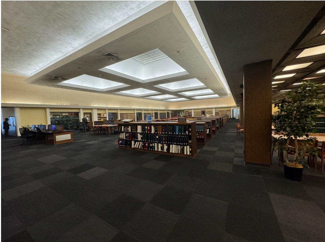
Photo 11 Library reading room, view facing west

Los Angeles, California County and State