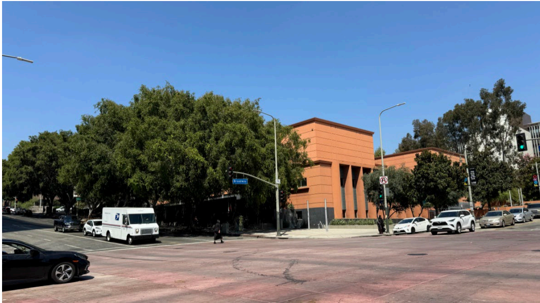
Photo 2 Library, view facing northwest toward south and east elevations (1 st Street and Broadway)