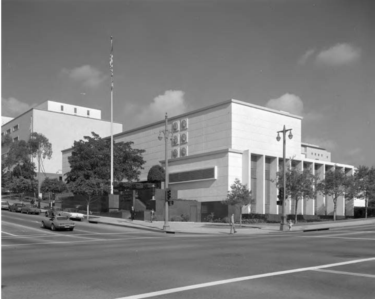
Figure 4 Looking northwest at intersection of 1 st Street and Broadway, 1969.

Los Angeles, California County and State