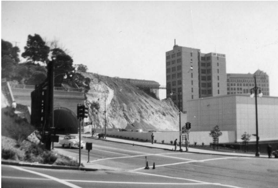
Figure 3 Looking west towards Broadway and 1 st Street intersection, Los Angeles County Law Library on right and County Courthouse under construction on left, 1959.