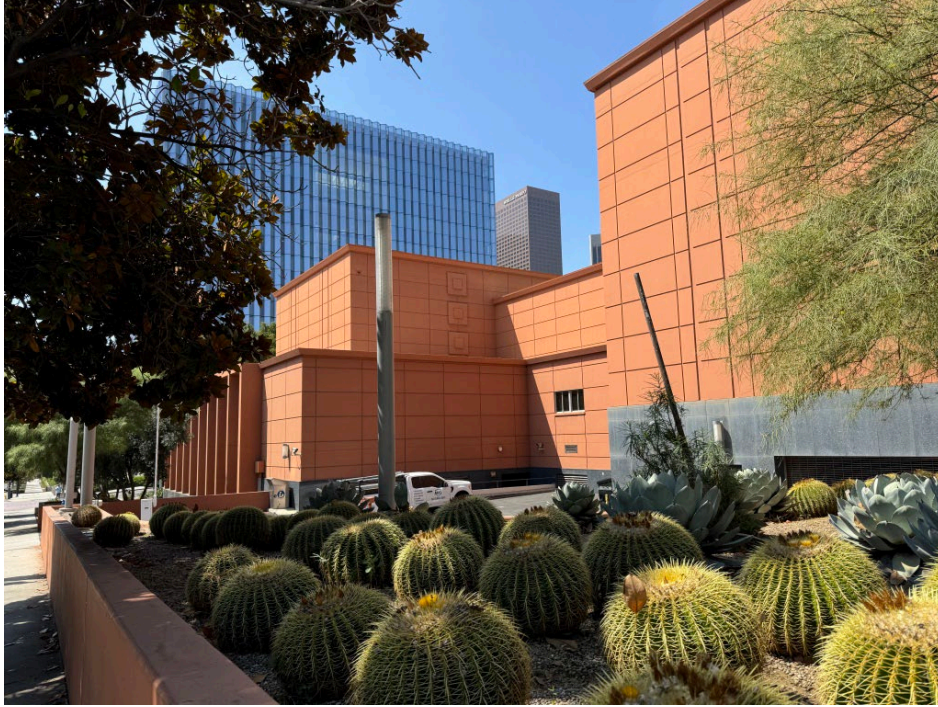
Photo 6 Library addition, view facing northwest toward north end of east elevation