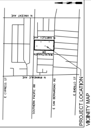
PROJECT LOCATION VICINITY MAP