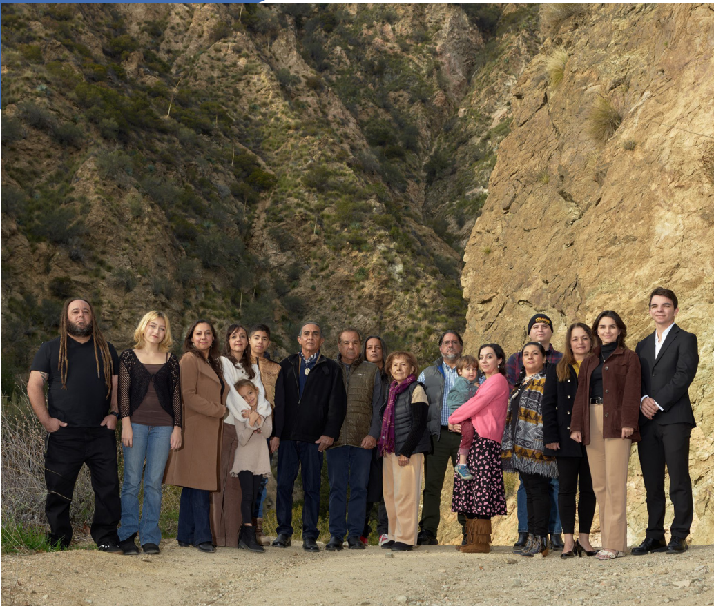
Gabrielino Tongva Indians of California Tribal members pose at Clara Basin (Henninger Flats).