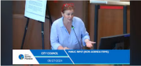
Santa Monica City Council Meeting.jpg 1167K