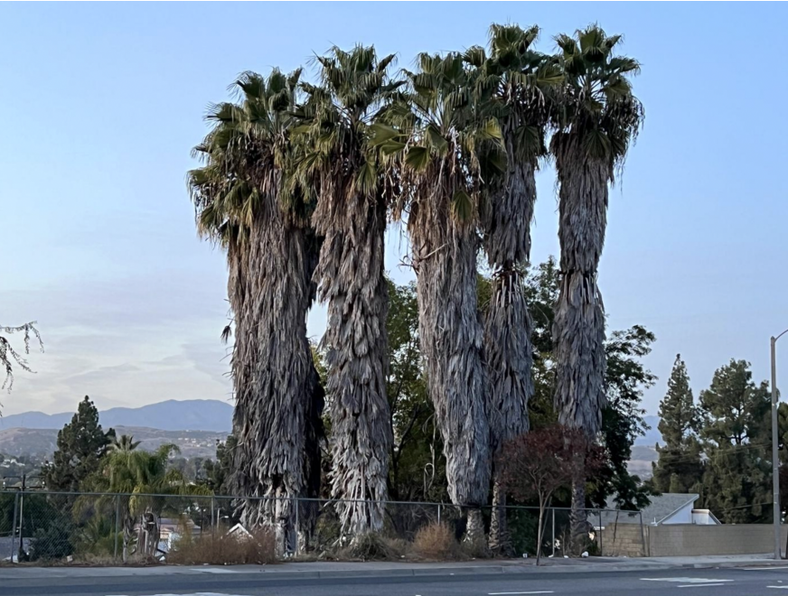
[Project planning areas 4 & 5]

As you can see in the images below, the palms are NOT regularly maintained, as they have long skirts that take several years to develop.