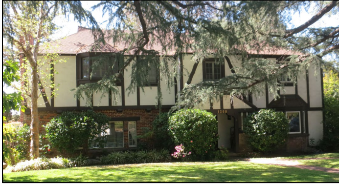
1360 New York Drive Historic Highlands Historic District Altadena

The Tudor Revival style shares its origins with the Arts and Crafts Movement whose founders looked for inspiration in English domestic architecture of the sixteenth and seventeenth centuries. Although it appears as early as the 1890s, the style reached its peak of popularity in the 1920s and 1930s as one of many revival styles adapted to the needs of rapidly growing communities. The Tudor Revival, along with its subtypes the English Cottage Revival and Storybook cottage, were particularly popular in Southern California here the idea of a “fairy tale” house particularly appealed to new arrivals. The style could work with grand estates as well as tiny cottages, and is found in domestic, ecclesiastic, and sometimes commercial architecture as well. The period of significance for the style is 1890 to 1940.