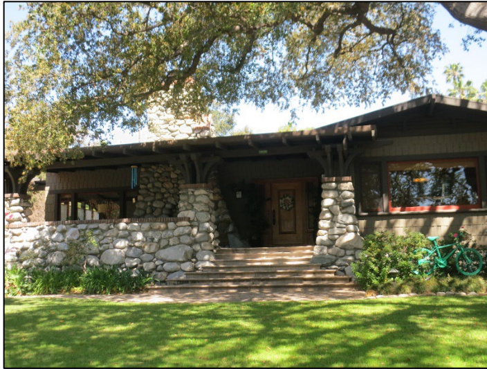
1115 E. Woodbury Road Historic Highlands Historic District Altadena

Craftsman homes can range from high style, architect-designed masterpieces, to modest one-story bungalows ordered from a catalog. Stylistically, a Craftsman house can have details borrowed from a Swiss chalet, or pagoda-style roofs and flared eaves inspired by Japanese architecture. What they have in common is an attention to detail and craftsmanship. The Period of Significance for the style is 1905-1930