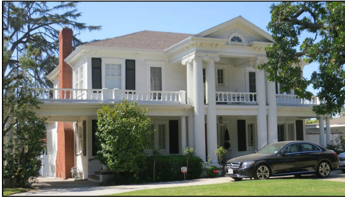
1390 New York Drive Historic Highlands Historic District Altadena

The Neoclassical style is an almost academic reinterpretation of Greek and Roman precedents. The style is primarily distinguished from Beaux Arts Classicism by its simpler treatment of classical forms, features, and ornament. Dignified, severe, and unornamented, these buildings tended to favor the Greek orders, Doric and Ionic, over the Roman. Colossal columns and colonnades, temple fronts with pedimented porticoes, and flat-headed windows characterize the style. Plain wall surfaces are not unusual, uninterrupted by projections, recessions, or sculpture. Neoclassical style residential buildings display many of the same qualities as commercial and institutional property types. A colossal order porch--whether a full-width colonnade or an attached portico with columns supporting a triangular pediment--adds a signature element of domestic design to this style. Other aspects of Neoclassical style houses are a direct reflection of Colonial Revival-style architecture. These buildings evoke symmetry with horizontal and raking cornices detailed with dentils or modillions, entries with arched or broken pediments, and double-hung sash windows with multiple lights in the upper sashes. The period of significance for the style is 1895 to 1955.