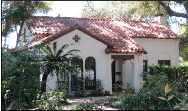
1030 New York Drive Historic Highlands Historic District Altadena

Spanish Colonial Revival-style architecture became popular throughout Southern California following the Panama-California Exposition held in San Diego in 1915. The exposition buildings were designed by architect Bertram Grosvenor Goodhue, who wanted to expand the limits of the Mission style and explore the more varied and rich precedents of Spanish architecture throughout Latin America. The exposition prompted other architects to look to Latin America and directly to Spain for inspiration. The style became especially popular in Southern California where it appeared to romanticize the region's colonial past, although visually had little in common with the adobes and missions constructed during that time. An adaptable style, it could be applied to a wide variety of property types with elaborate expressions or through simple details. The style is characterized by its complex building forms, stucco-clad wall surfaces, and clay tile roofs. The period of significance for the style is 1915 to 1940.