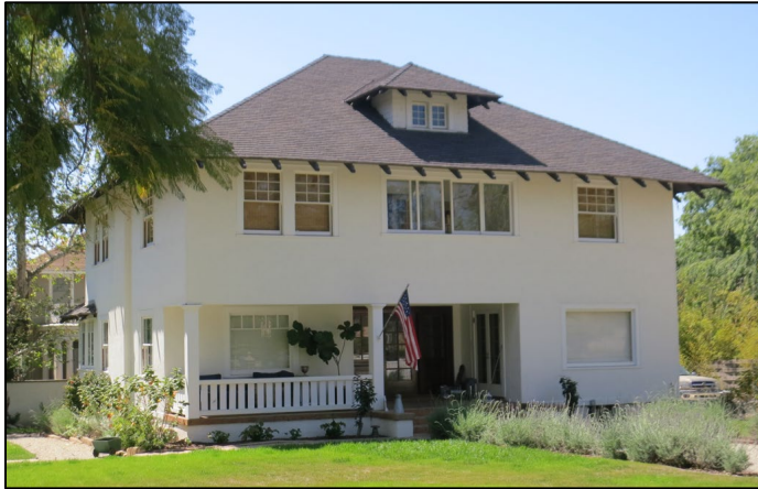
1000 New York Drive Historic Highlands Historic District Altadena

A uniquely American house, the American Foursquare was one of the earliest responses to the ornate and elaborate Queen Anne designs that precede it. The basic, clean lines and sparsely ornamented surfaces made it more affordable and easier to construct. Because of its simplicity, this style was popular in Sears Catalogues and other mail-order companies. The Period of Significance for the style is 1880 to 1955.