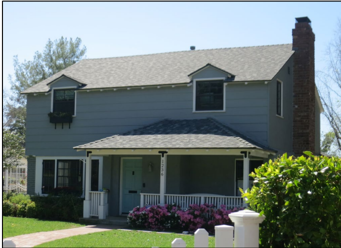
1236 New York Drive Historic Highlands Historic District Altadena

Modern Colonial represents a continuation of the popularity of the American Colonial Revival style through much of the twentieth century. The style was more simplified than its earlier counterparts and often suggested earlier eighteenth-century design elements rather than recreating them. It was frequently used in residences that were not necessarily architect designed. The stripped-down style lent itself well to the large numbers of residences, both single- and multi-family, that were constructed after World War II.