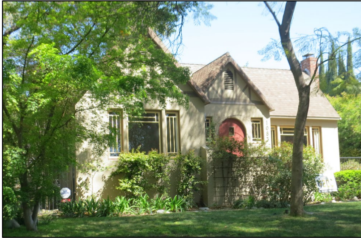
1083 Atchison Street Historic Highlands Historic District Altadena

The English Cottage Revival style is a smaller scale version of the Tudor style, typically one-story with simpler roof forms. Brick or stone is more commonly used than stucco and the walls have less half-timbering details. The steeply pitched roofs may have a rounded shape at the eaves to mimic the thatched roofs of English country cottages. The period of significance for the style is 1890 to 1940.