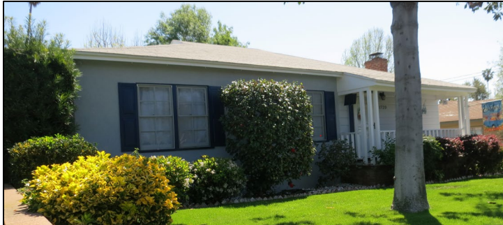
1720 Mar Vista Avenue Historic Highlands Historic District Altadena

The Minimal Traditional style is defined by simple exterior forms with a one-story plan and minimum use of architectural detail. With origins in the Modern movement, the style grew in popularity during the Depression and continued into the years following World War II. It was popular in suburban residential developments throughout the United States because it could be built quickly and cheaply. In Southern California the style continued well into the post-war years in large scale developments. The period of significance for the style is 1935 to 1950.