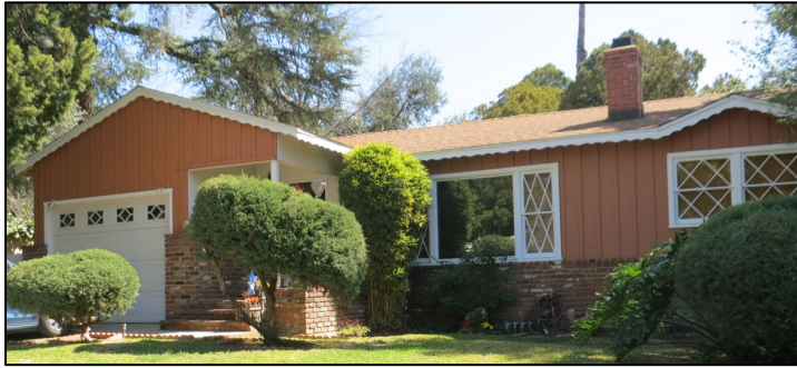
1854 Mar Vista Avenue Historic Highlands Historic District Altadena

As a style, Ranch has its roots in Southern California where architect Cliff May was one of several architects who merged the rustic adobe “rancho” idea with Modern aesthetics in the late 1930s. Prior to World War II, these custom-designed “haciendas” had clay tile roofs and stucco exteriors. During this same time, developers were looking at the Ranch house as the solution to building appealing houses on a massive scale. After the war, lenders such as the Veterans Administration and the Federal Housing Administration found that the Ranch house design best met their standards. This combination of factors led to the Ranch house becoming the most popular housing style from the 1940s through the 1970s. The period of significance is 1935 - 1985.