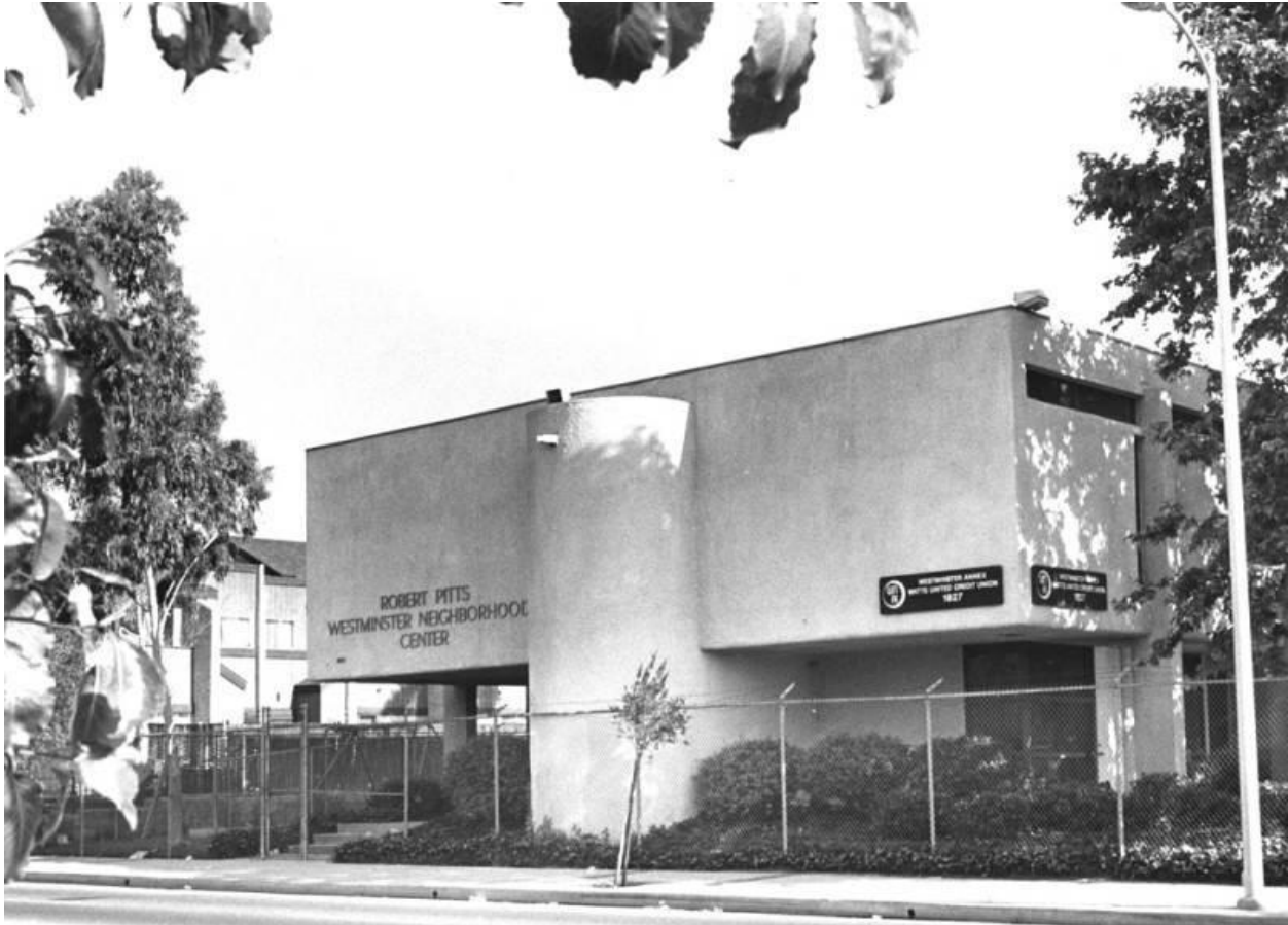
Figure 6: Watts Neighborhood Center, circa 1981