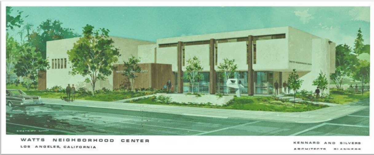
Figure 3: Architect's rendering, 1969, photo courtesy of UCLA/Gail Kennard.