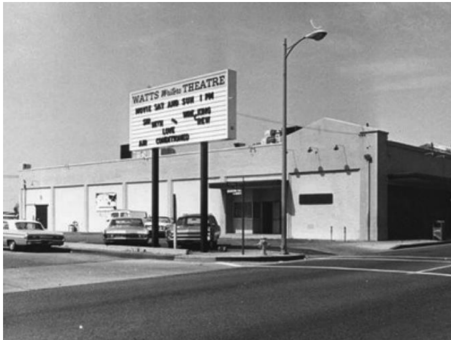
Figure 2: Watts Writers Theatre, 1690 E. 103 rd Street, circa 1970, photo courtesy Cornerstone Theater Company Blog, https://cornerstonetheater.org/change-series/jordan-downs-transformation-by-the-decade-1970s/