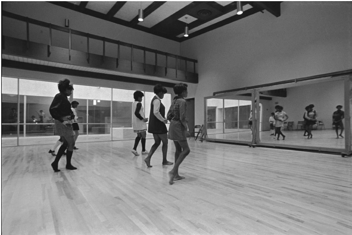
Figure 4: Dance class in multi-purpose space, February 2, 1971, Los Angeles Times Photographic Collection, UCLA Digital Library.