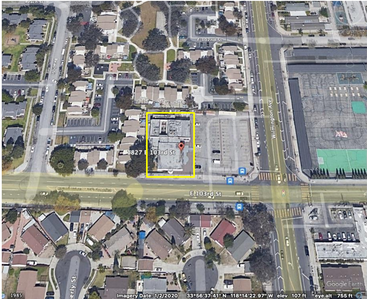
Base map courtesy of Google, property boundary outlined in yellow.