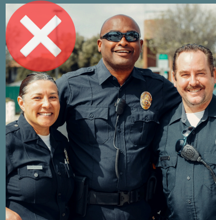
Other Law Enforcement Agencies

The POC does not accept complaints about LA Sheriff Deputies who are not contracted to work at schools.