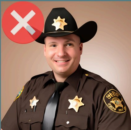
Los Angeles Sherriff Deputy

A School Resource Deputy (SRD) is a sworn law-enforcement officer, employed by the Los Angeles County Sheriff's Department, who provides school-based law enforcement services and crisis response. An SRD may also provide school security and assist in identifying physical changes in the environment that may reduce crime in or around the school.