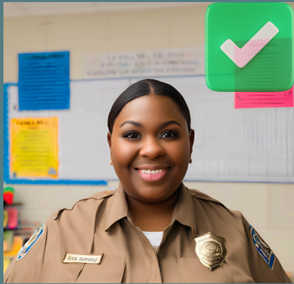
School Resource Deputy

The Probation Oversight Commission (POC) accepts complaints about School Resource Deputies (SRDs) employed by the Los Angeles County Sheriff's Department (LASD). We will discuss your complaint with you and help you submit it to LASD for investigation. The POC does not investigate complaints. If you have questions, please contact us at info@poc.lacounty.gov or (213) 633-5777. Multilingual assistance is available.