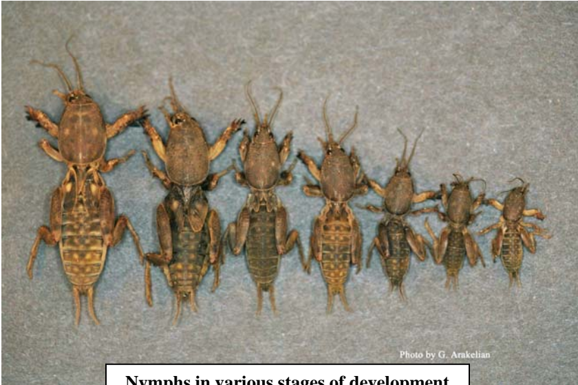
Nymphs in various stages of development