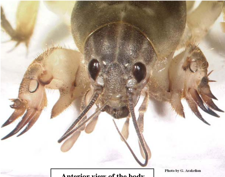
Anterior view of the body