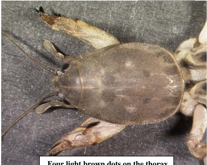
Four light brown dots on the thorax