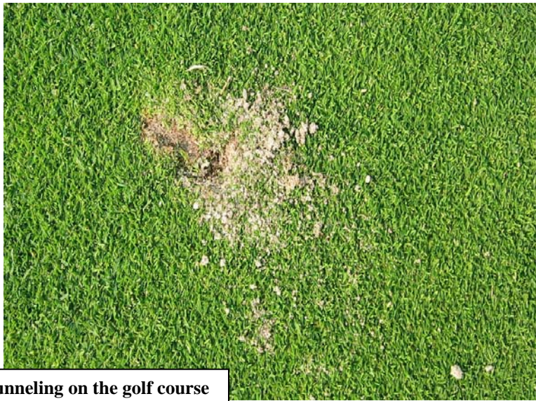
S. borellii excavations and tunneling on the golf course