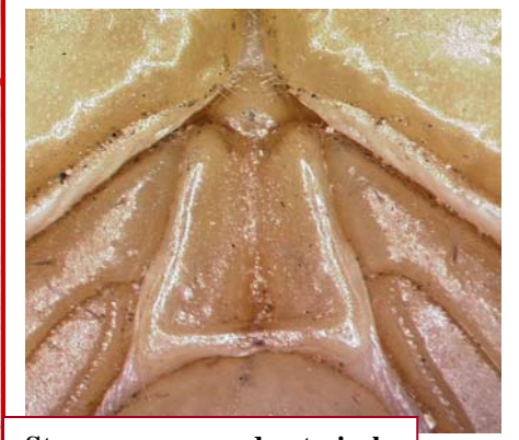
Sternum narrowed anteriorly (subtriangular)