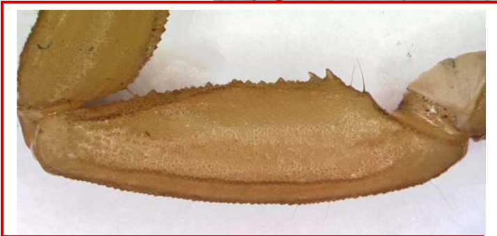
Ventral surface of pedipalp patella without trichobothria