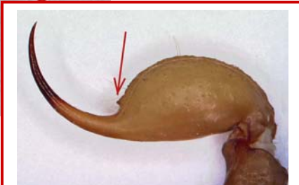
Telson with subaculear tubercle