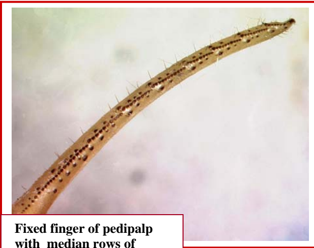
Fixed finger of pedipalp with median rows of granules fringed by rows of supernumerary granules