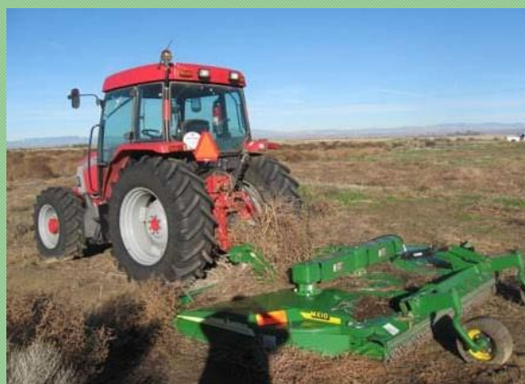
A tractor with a mowing attachment. Carefully timed seasonal mowing has been an effective method in the battle against the spread of tumbleweeds.