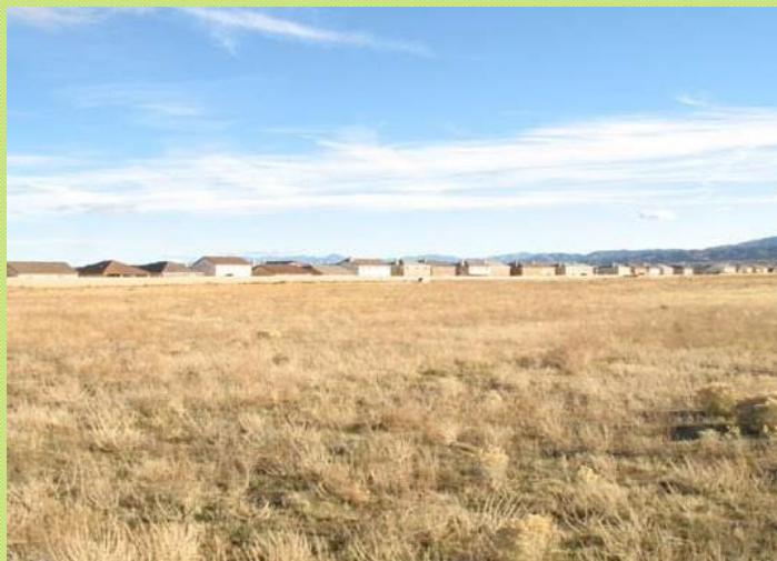
The photo above was taken in December of 2010 and shows the field which was the source of the tumbleweeds shown in the previous photo. Carefully timed tumbleweed mowing since 2006 created a vegetative mulch over the soil preventing the reestablishment of the once expansive tumbleweed growth.