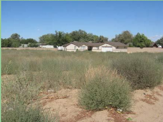
ACWM does not consider green tumbleweeds to be a public nuisance, but they may be abated along with annual weeds if occurring amongst them.