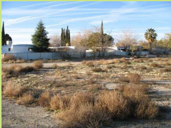
This photo is an example of the condition of a parcel that the owner should call ACWM in order to determine whether clearance is necessary.