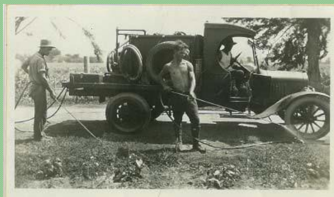
ACWM employees attempting to eradicate puncturevine in the San Fernando Valley in about 1938.

One of ACWM's missions has always been to attempt to control the spread of invasive weeds and in 1990, launched a major effort aimed at tumbleweeds. The initial plan to perform widespread tumbleweed burning proved highly controversial so ACWM reconsidered and discovered that carefully timed seasonal mowing not only destroyed existing tumbleweeds in place, but also the mulch left behind helped to prevent them from growing back the next year. Many areas of the Antelope Valley that were once almost a sea of tumbleweeds have experienced a type conversion or habitat change back to grassland with currently little or no tumbleweeds (see photos below). ACWM's fight with tumbleweeds is not over yet, but the invasive plant has never again reached the levels experienced at the beginning of the program.