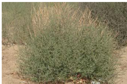
Russian thistle is commonly referred to as tumbleweed.

The climate, geography, periodic high winds and other factors make the Antelope Valley area of Los Angeles County vulnerable to the growth and spread of tumbleweeds. Fortunately, the destructive and nuisance potential of tumbleweeds has diminished over the last 20 years as a result of a cooperative effort of many Antelope Valley property owners and the Los Angeles County Department of Agricultural Commissioner/Weights and Measures (ACWM).