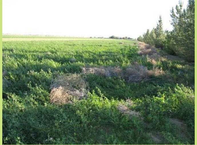
Tumbleweeds can blow into agricultural fields and take considerable effort to remove by hand.

Many individuals are allergic to the plant's pollen and sap causing dermatitis (skin rash) and rhinitis (runny nose). Their movement by the wind across roadways and busy intersections causes traffic hazards. Blown into waterways and canals they clog and disrupt what would otherwise be the free flow of water and a mass of tumbleweeds in a swimming pool are a minor disaster.