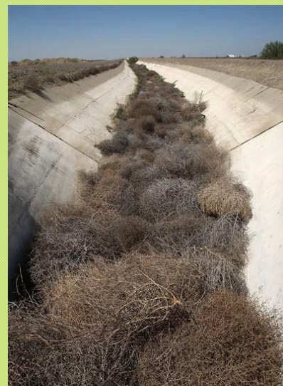
Tumbleweeds in an irrigation canal.