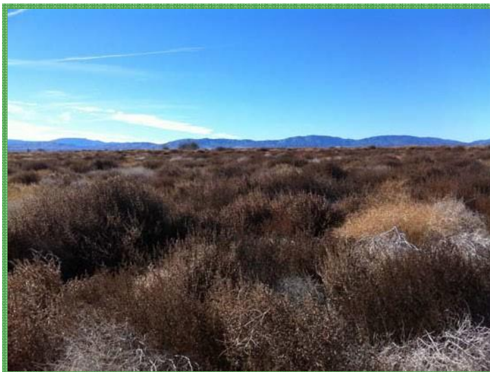
Tumbleweeds on a vacant lot in the Antelope Valley.