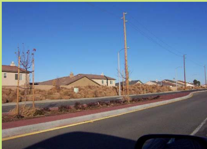
The photo above taken in December of 2006 shows the wind borne result of an expanse of tumbleweeds being blown off of an adjacent property and across the boulevard near the intersection of Avenue K and 60 th Street West in Lancaster. The tumbleweeds piled along and over the block wall of the neighboring residential development.