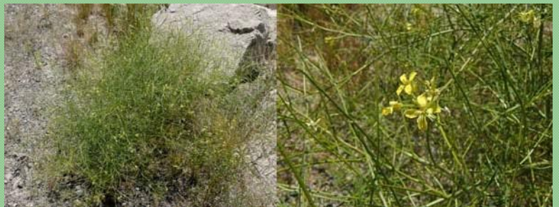
Tumble mustard ( Sisymbrium altissimum )