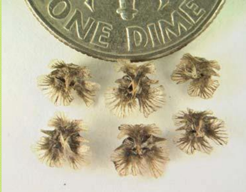
Tumbleweed seeds. A large plant can produce as many as 200,000 of these!