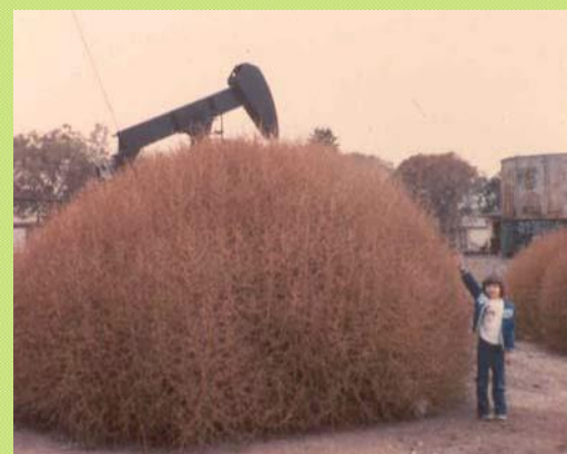
ACWM archival photo of a young boy standing next to a very large tumbleweed at an unknown location.

The following guidelines are specific to tumbleweeds.