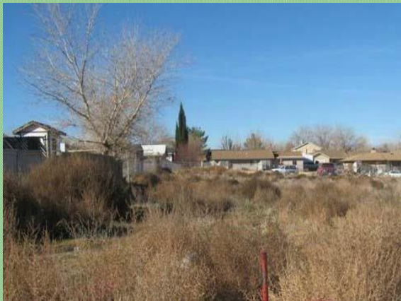
These dry and dead tumbleweeds are within 100 feet of adjacent structures. ACWM would require the removal of this extreme fire hazard.

Antelope Valley Air Quality Management District