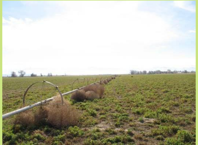
Tumbleweeds can pile up on automated irrigation equipment, such as the one shown in this photo, causing damage to the irrigation equipment.