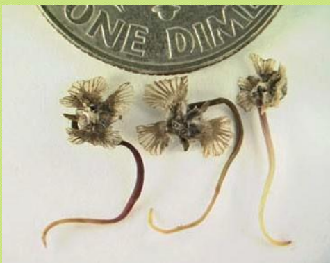
Tumbleweed seeds with the taproots uncoiled and ready to search for moisture. This process can take as little as 12 hours giving tumbleweeds a competitive advantage over many plants under low moisture conditions.