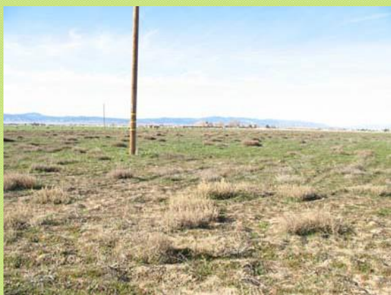
ACWM would not require removal of the tumbleweeds scattered across the property above if it remained in this condition.