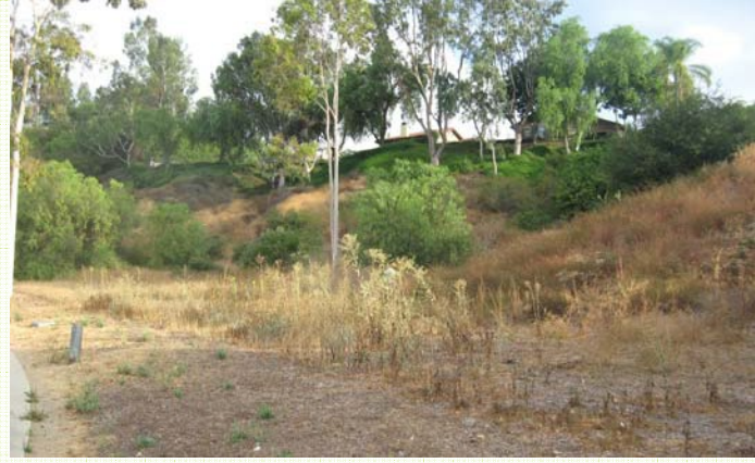
Dry weeds, such as the ones shown in this photo, can act as a "ladder" for a fire to be transmitted from the weeds to the surrounding vegetation and the homes located at the top of the hill.

A fuel ladder is a firefighting term for live or dead vegetation that allows a fire to climb up from the landscape or forest floor in to the tree canopy. Ladder fuels can create a direct path for fire to a structure (e.g. home). Dry weeds next to brush can act as a "ladder" for fire to be transmitted from the weeds to the adjacent brush and beyond.