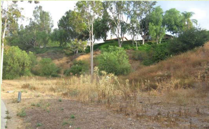
Dry weeds, such as the ones shown in this photo, can act as a "ladder" for a fire to be transmitted from the weeds to the surrounding vegetation and the homes located at the top of the hill.

A fuel ladder is a firefighting term for live or dead vegetation that allows a fire to climb up from the landscape or forest floor in to the tree canopy. Ladder fuels can create a direct path for fire to a structure (e.g. home). Dry weeds next to brush can act as a "ladder" for fire to be transmitted from the weeds to the adjacent brush and beyond.