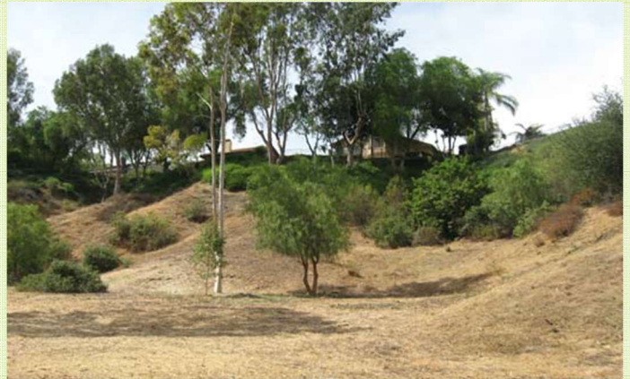
The dry weeds were abated and other vegetation was limbed up to reduce the fire hazard.