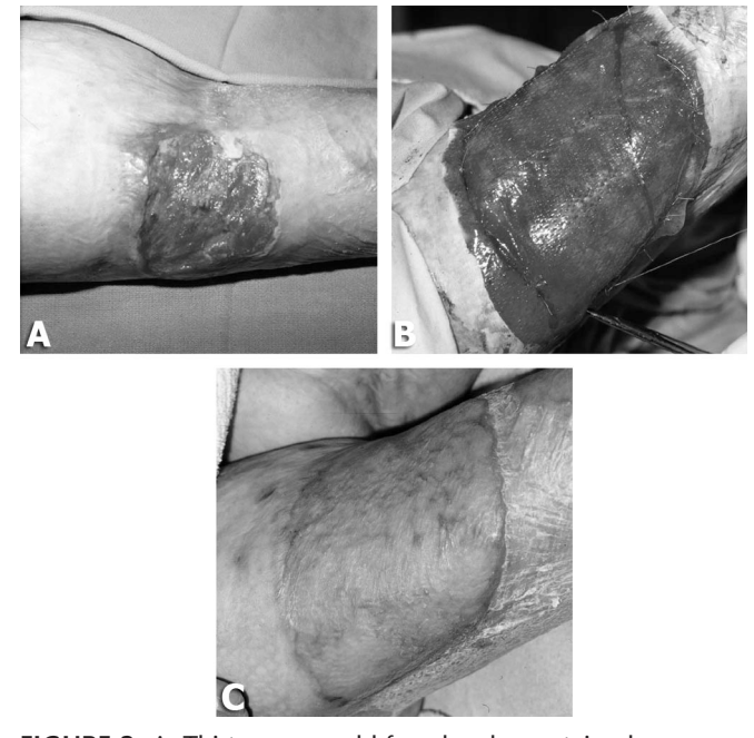
FIGURE 3. A, Thirteen-year-old female who sustained an approximately 90% total body surface area burn at the age of 3. She developed a chronic, nonhealing ulcer of her right thigh, just proximal to the popliteal fossa. B & C, Biopsy confirmed squamous-cell carcinoma moderately to well differentiated. Given the need to recrop from previously harvested donor sites, the decision was made to close this wound with Integra.

days. The overall engraftment rate of Integra was 98\% \pm 4\% and autograft was 97\% \pm 4\% . Two patients developed wound infections following skin graft coverage of the Integra. Both