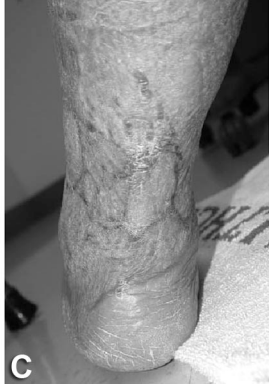
FIGURE 1. A, Fifty-year-old female with 10% circumferential full-thickness flame burn to her right lower leg. Following burn excision and initial skin grafting, a small area of Achilles tendon was exposed. B, Integra was placed on this open area (surface area of 80 cm<sup>2</sup>). C, The Integra gradually vascularized and was subsequently covered with a split-thickness skin graft.