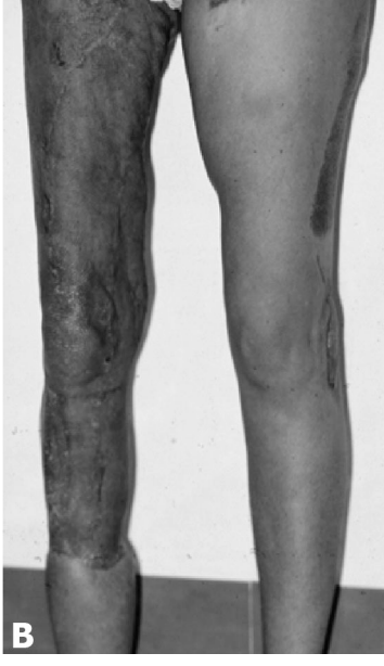
FIGURE 4. A & B, Twenty-four-year-old woman with a traumatic degloving of her right lower extremity. Given the extent and fascial depth of this wound, Integra was used to improve the appearance of the grafted wound and minimize the risk of knee contracture.

patients were treated with topical and systemic antibiotics and healed without the need for regrafting.