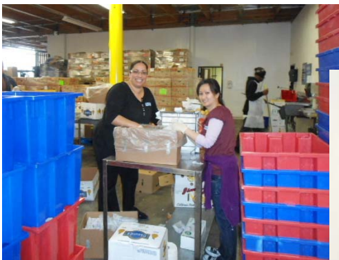
Photos from the 2012 Cesar E. Chavez Community Service Week.

Last year, hundreds of employees participated at the Weingart Center, L.A. Regional Food Bank, and at the departments of Animal Care and Control, Beaches and Harbors, Parks and Recreation, Public Library, Public Social Services, Probation, and Military and Veterans’ Affairs. Employees enjoyed volunteering their time and giving back to our communities.