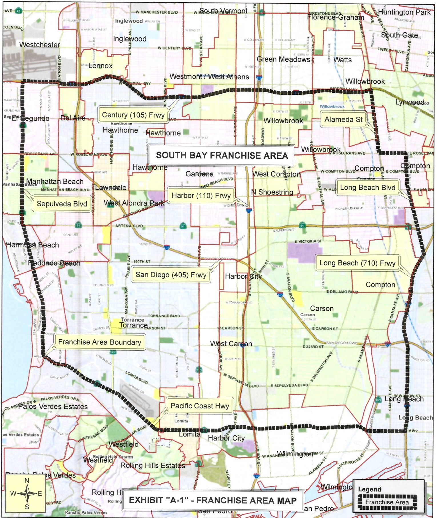
EXHIBIT "A-1" - FRANCHISE AREA MAP