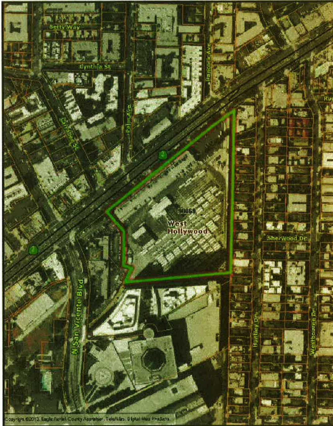
EXHIBIT B LACMTA PARCEL, DIVISION 7