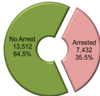
Figure 1 – Percentage of PSPs Arrested During Supervision Period

Probation tracks the percentage of PSPs who have been arrested for new criminal activity as a measure of PSP performance. Figure 1 provides the number and percentage of PSPs who have been arrested at least once for a misdemeanor or felony since the inception of the program. This arrest data does not include bookings for flash incarceration or account for multiple arrests of one individual.