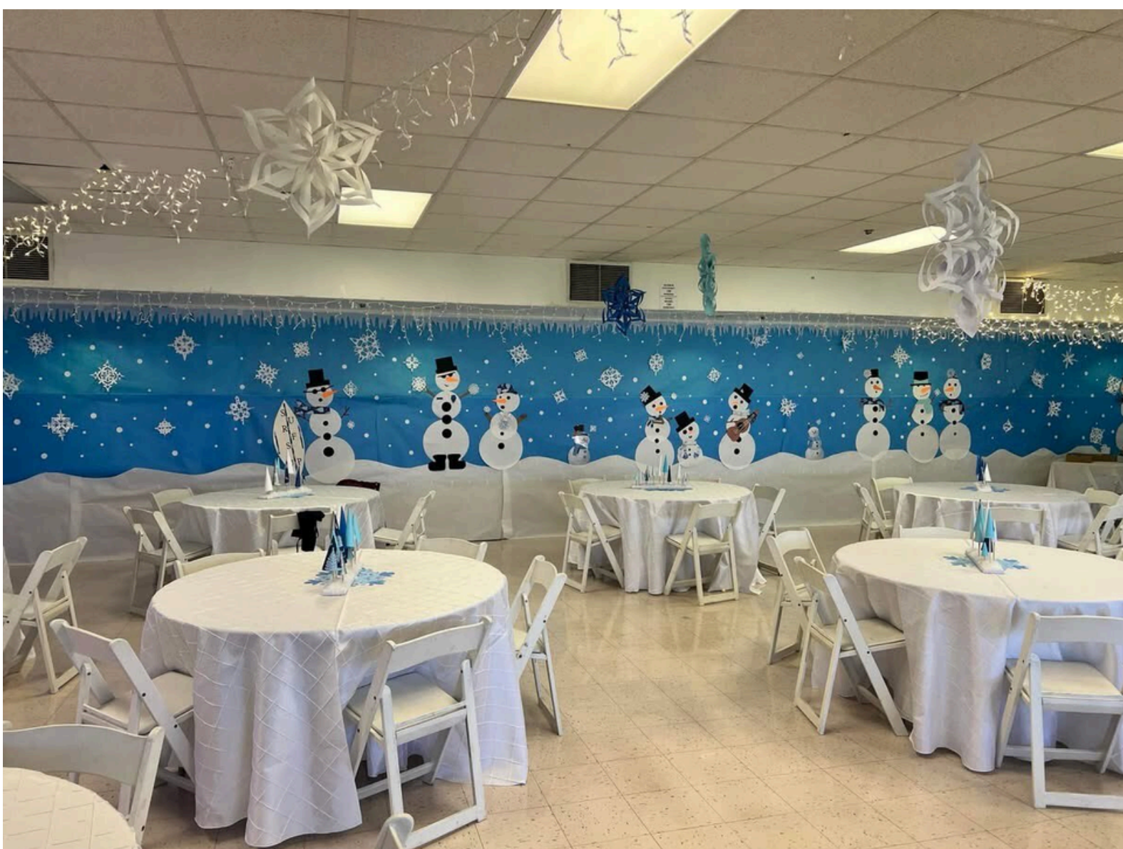
Barry J Nidorf Secure Youth Treatment Facility hosted a beautiful Winter Wonderland for the youth and their families. Forty-five parents attended and ten children came to celebrate with their fathers. During the festive event families built gingerbread houses and shared a catered meal. Parents were gifted gas cards and children left with wrapped gifts and Build-A-Bear gift cards. Many memorable moments included a youth reuniting with his mom after 4 years, a youth meeting his new baby sister for the first time, and another holding his newborn child for the first time. Hearts were full of the holiday spirit. Thank you to the SYTF Officers who made this beautiful day possible!