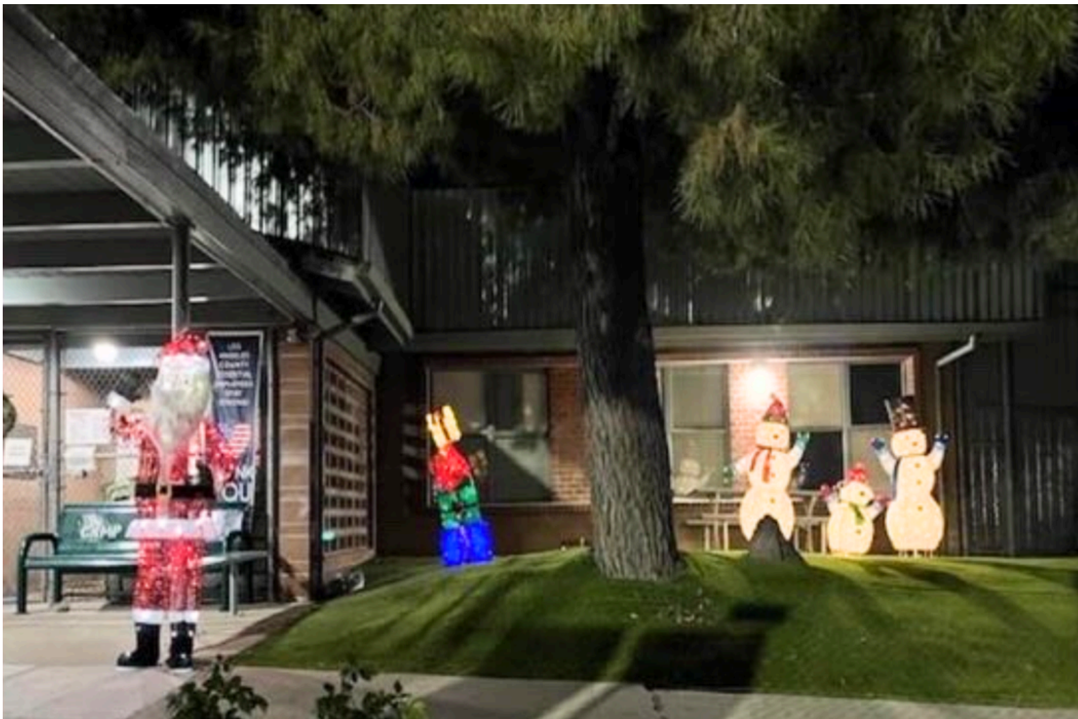
During the Holidays, Camp Afflerbaugh was bursting with Holiday cheer! The youth stayed busy decorating their dorm Christmas tree, crafting adorable snowman ornaments, hanging personalized stockings, creating miniature trees, and staying cozy with hot cocoa. Thank you to the staff at Camp Afflerbaugh!