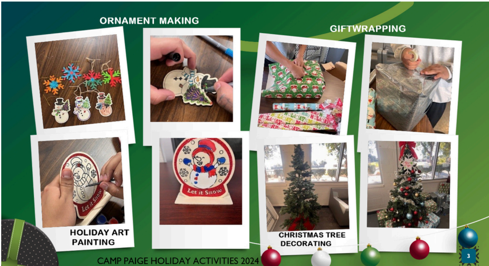
Camp Joseph Paige was also filled with holiday cheer, celebrating the season with fun, creative, and uplifting activities. The youth enjoyed building gingerbread houses, decorating cookies, painting festive artwork, coloring ornaments, trimming the Christmas tree, and wrapping gifts. Warm holiday wishes from everyone at Camp Paige!