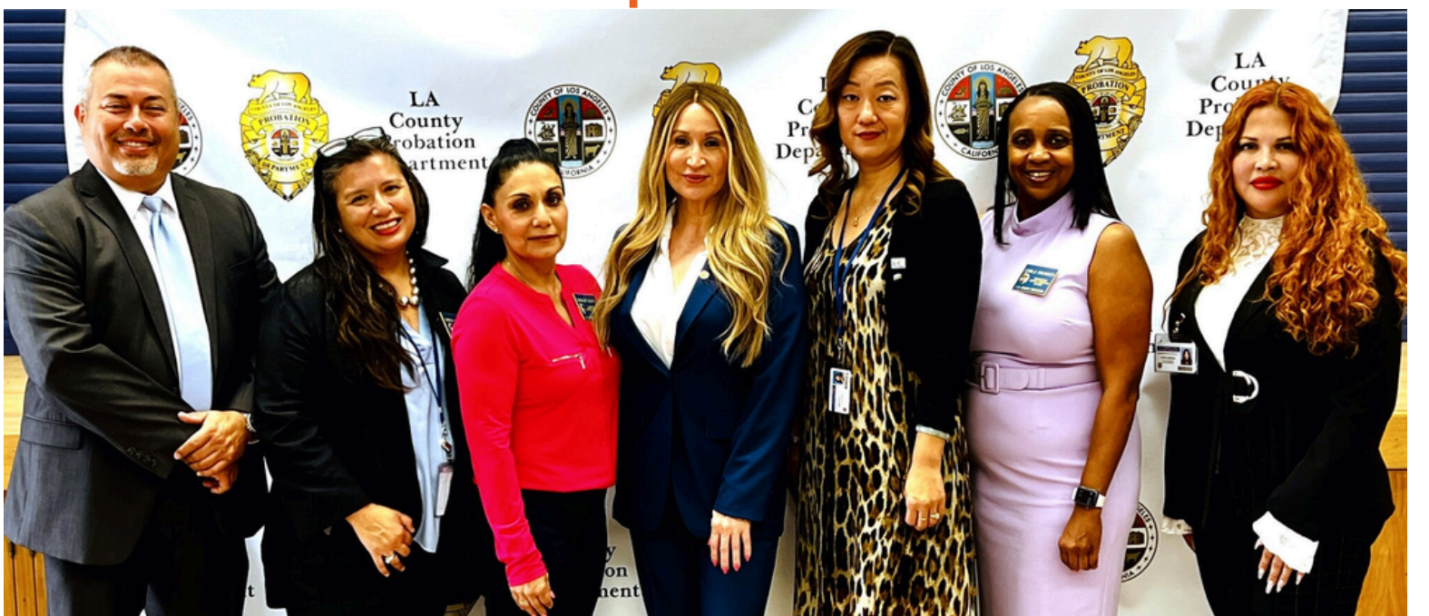
Congratulations to the Los Angeles County Probation Department's College Intern Program on receiving a Special Certificate from the Los Angeles County Productivity and Quality Commission.