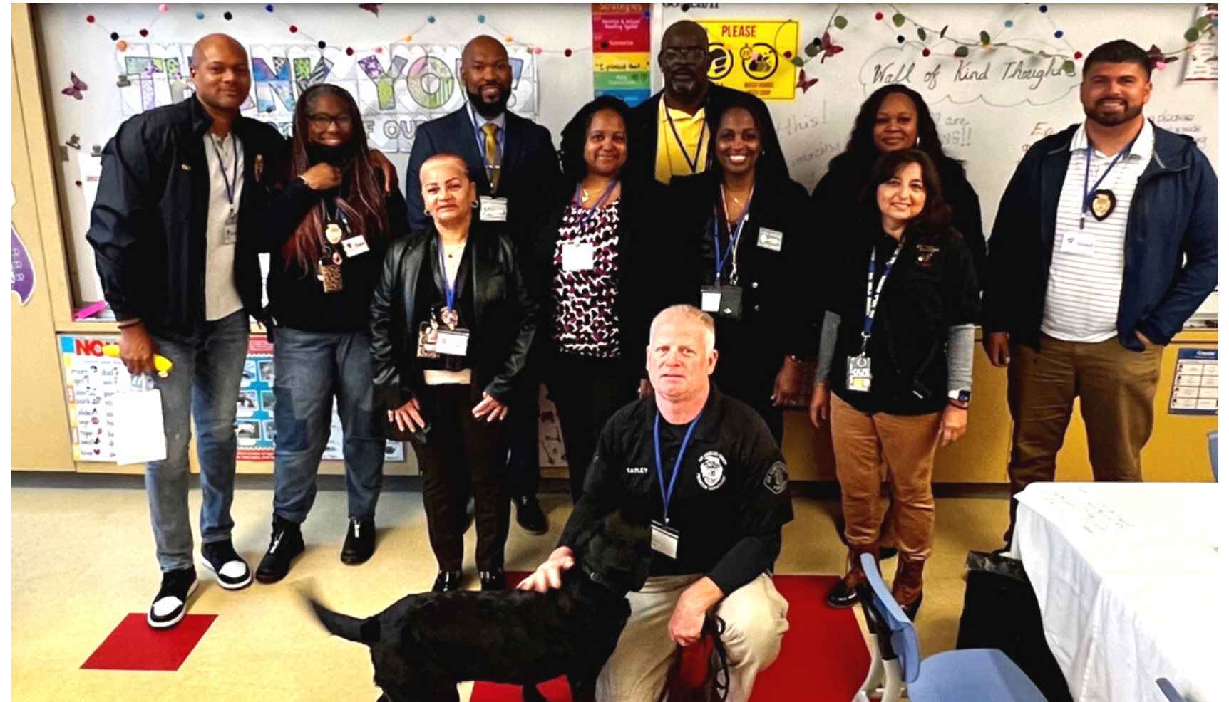
South LA AB-109, Mobile Resource Center, and K9 Units Participate in Estrella Elementary Schools Career Day