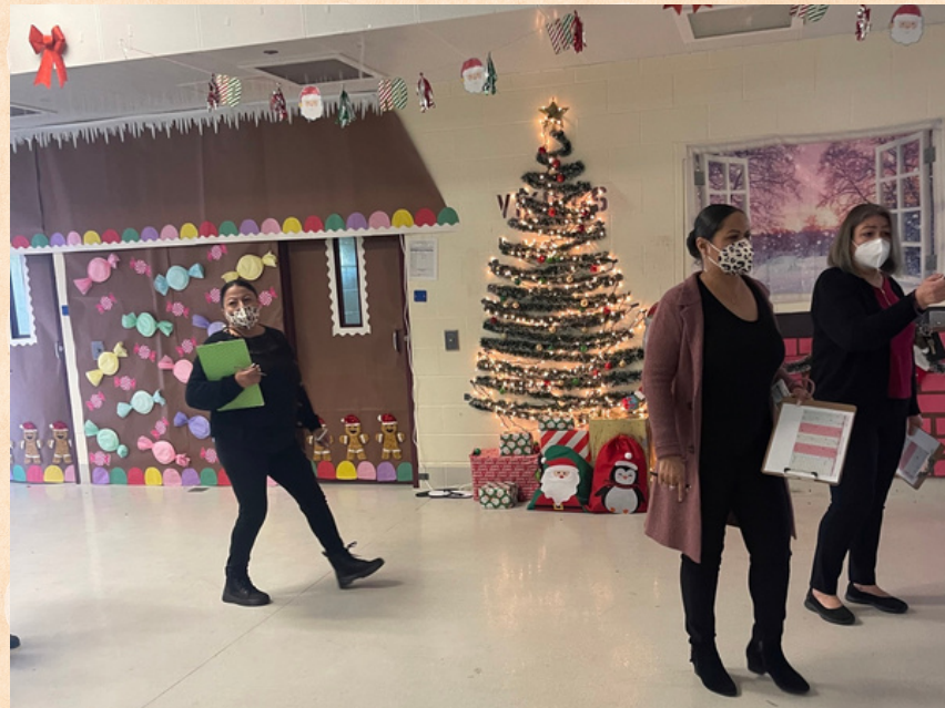
Expert judges search for the winning holiday decorations