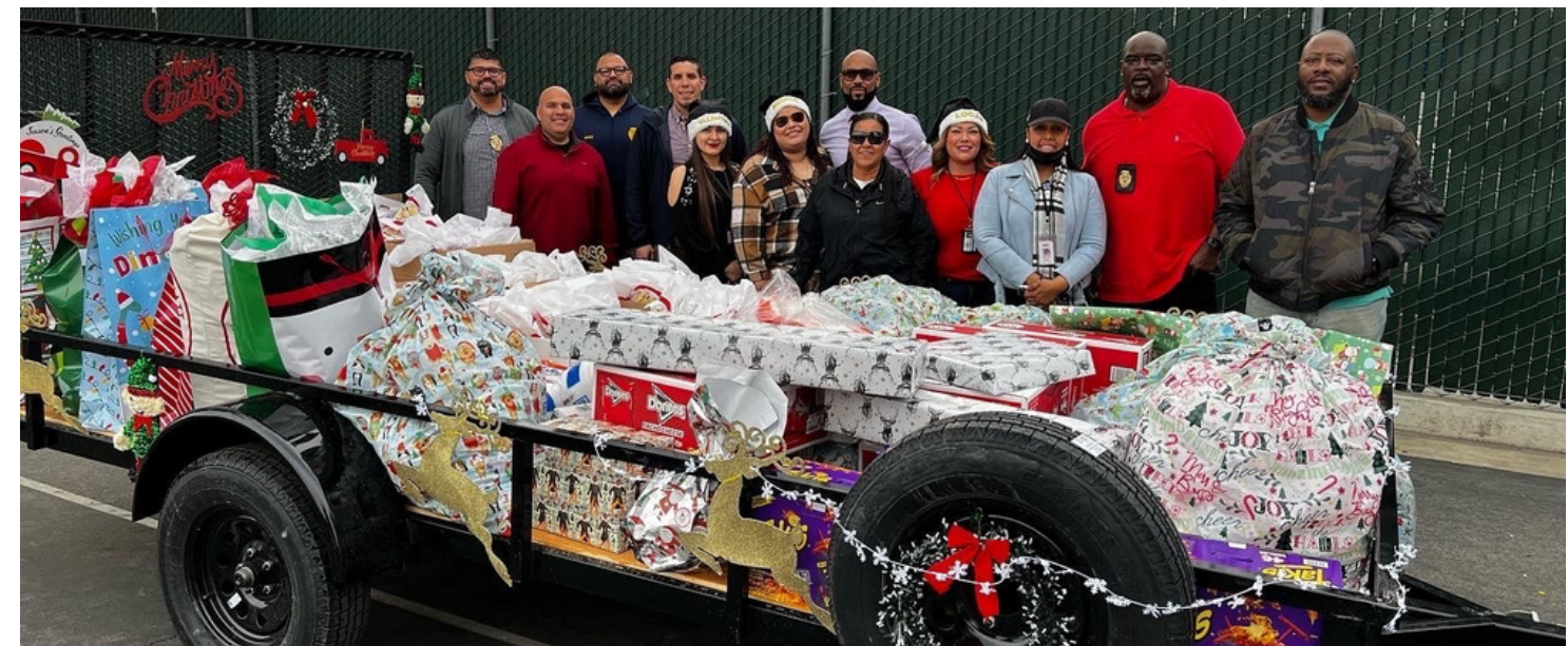
South LA Area Office AB-109 Deputies adopted Estrella Elementary School for the Holidays

The AB-109 DPOs also spread a little extra holiday cheer and provided seven students whose families fell on hard times with additional gifts, including toys, clothing, coats, shoes, and gift cards. The DPOs ended their visit with a pizza party for the entire school.