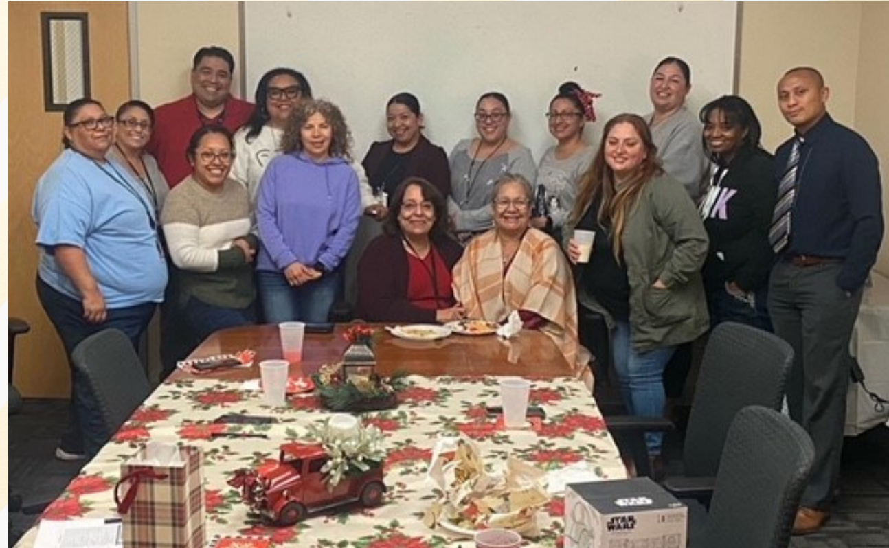
San Fernando Valley Regional Office's AB109 Deputies hosted a Holiday Toy Drive for clients that were in need with children, siblings, and grandchildren. The staff also celebrated the Holidays with tacos, a gift exchange and door prizes.