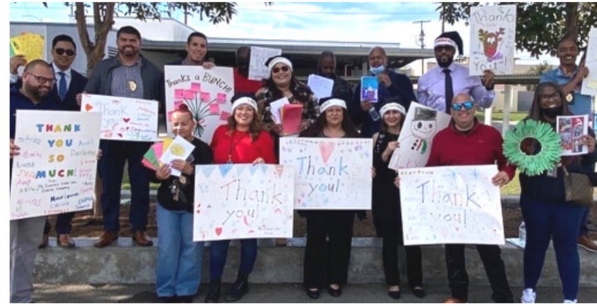
South LA AB-109 DPOs with Estrella Elementary School student thank you cards