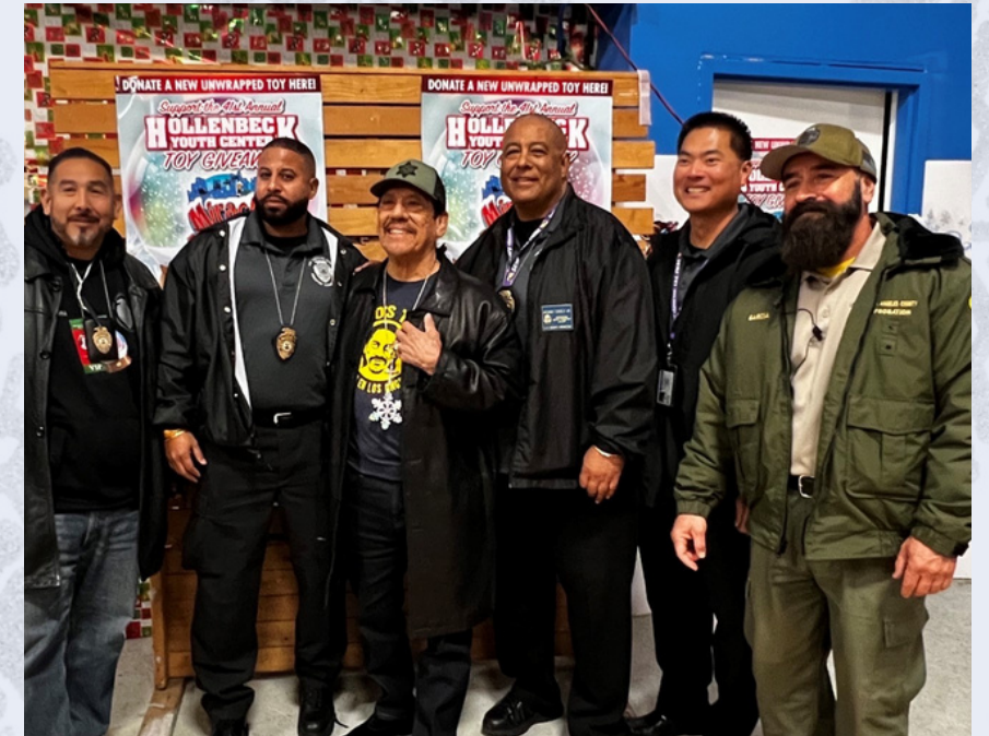
Actor Danny Trejo came to lend his support

On December 17th, several Los Angeles County Probation Department staff volunteered at the Hollenbeck Youth Center's annual production of "Miracle on 1st Street." Ten thousand toys were given away, and blocks of First Street in the city of Boyle Heights were closed so residents could enjoy the holiday spirit, fill their tummies with food, and enjoy entertainment, promotional items, and toys provided by local businesses. Celebrities Arnold Schwarzenegger and Danny Trejo also joined in on the fun and helped distribute toys to children.