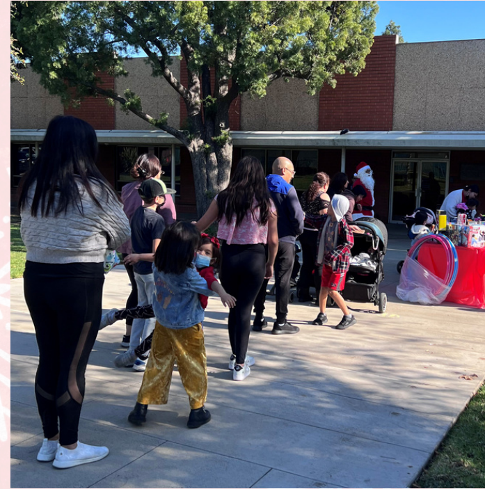
A well served community