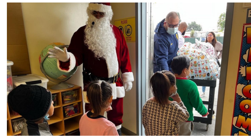
Santa and South LA AB-109 DPOs pass out sweet treats to Estrella Elementary students