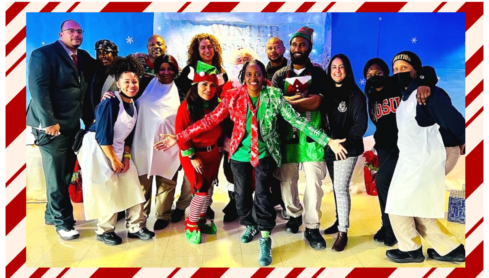
BJNJH Staff enjoying the Winter Wonderland Holiday Luncheon

It was an amazing week at BJNJH. The youth enjoyed fun Holiday activities, and the staff was celebrated for their commitment and dedicated service in 2022.