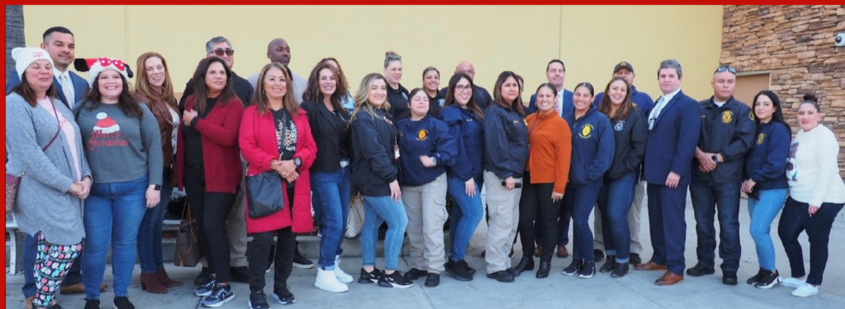
LA County Probation Deputies participate in the National Latino Probation Officers Associations San Gabriel Valley Chapter "Holiday Heroes" event.