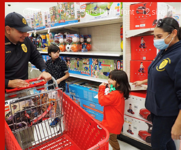
LA County Probation Deputies Sponsor Youth on Target Shopping Spree