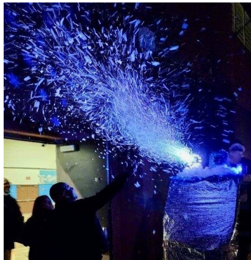
Faux Snow welcomes the youth into the Winter Wonderland