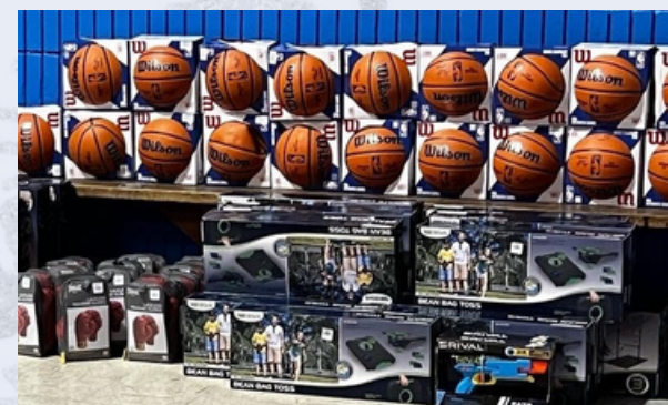
Lots of goodies were donated for the annual event