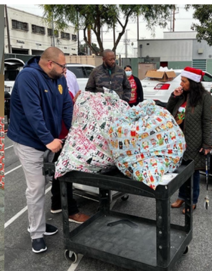
South LA AB-109 DPOs preparing to distribute toys