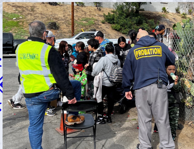
LA County Probation Deputies facilitating entry into Miracle on 1st Street Toy Giveaway

This year's event was a huge success. Residents couldn't have been more joyful. Probation staff showed up and made meaningful contributions toward the happiness of local families.