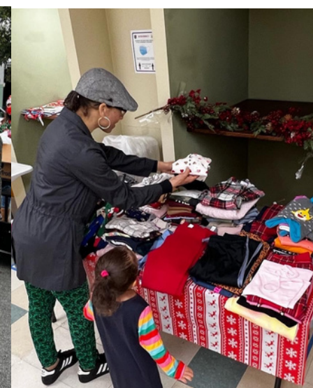
Gender-Specific DPO II Montavo gifting clothes for the Holiday.