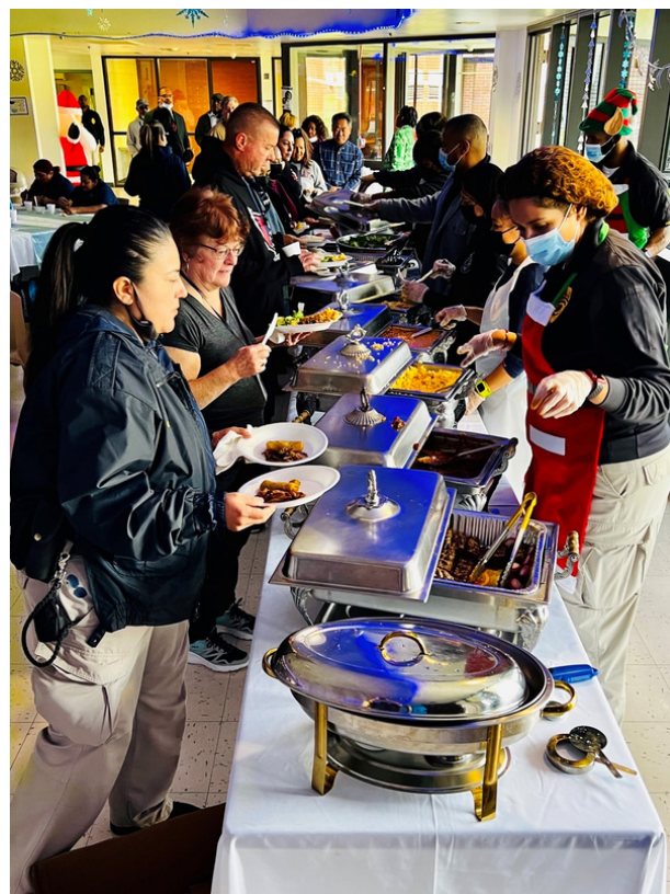
BJNJH Staff enjoy a international cuisine luncheon with a Winter Wonderland theme