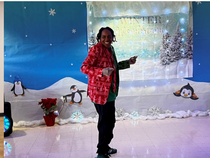
SDPO McCrimmon leading everyone in a dance break during BJJNH Winter Wonderland