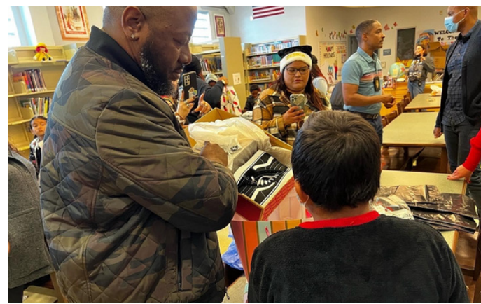
AB 109 DPO gifts shoes to a student for the Holiday