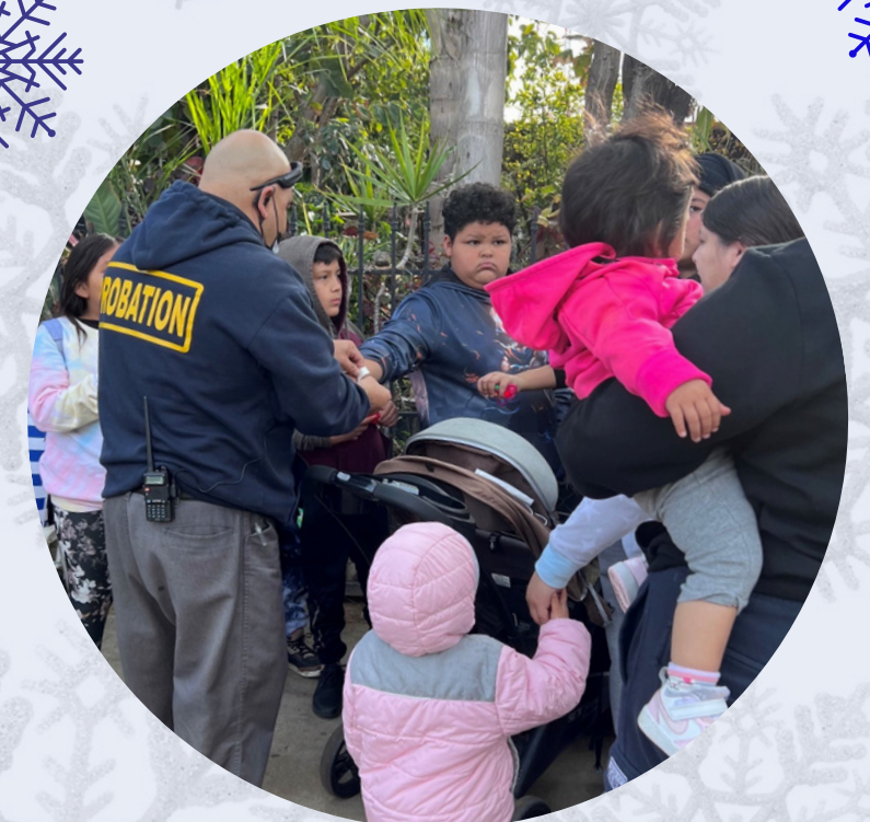
LA County Probation DPO distributing entrance bracelets to children for the Miracle on 1st Street Toy Giveaway