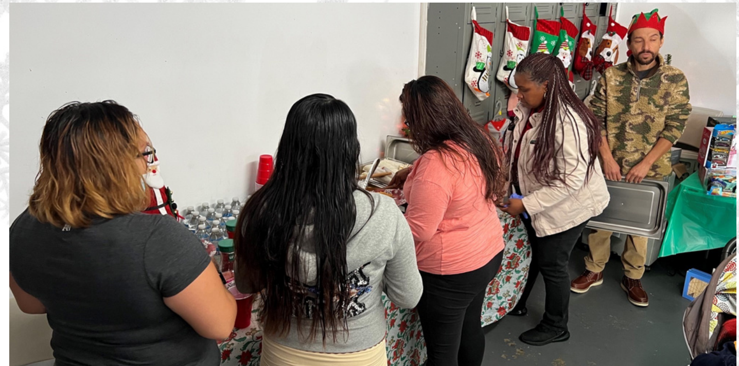
Residents enjoying Holiday Lunch.