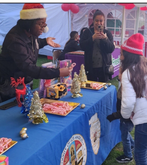
Parks After Dark

Happy Holidays and Happy New Year to each of you!