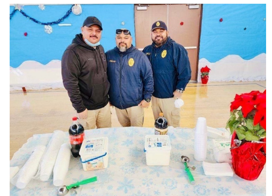
BJNJH Detention Services Officers preparing the youth Rootbeer float station at Winter Wonderland