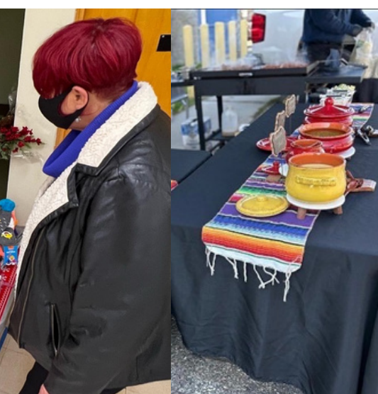
San Fernando Valley Regional Office