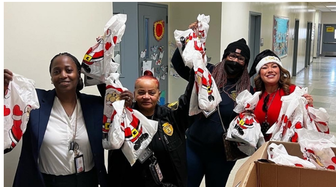
South LA AB-109 Deputies distributing goody bags to Estrella Elementary School classrooms