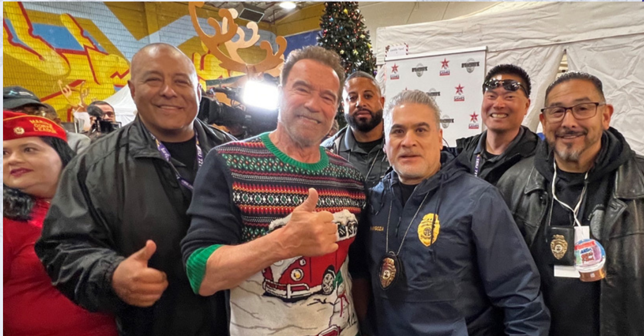
LA County Probation Deputies and Actor-Former California Governor Arnold Schwarzenegger