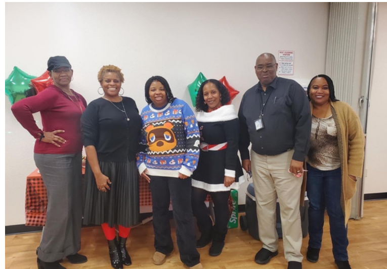
Antelope Valley and Valencia Juvenile Area Offices