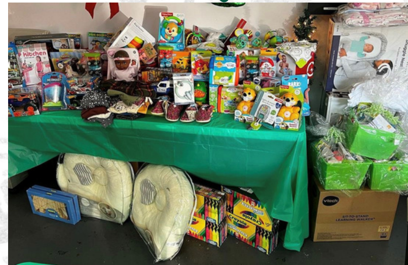
Toys and everyday essentials donated by the Mental Health Housing Court Program Deputies