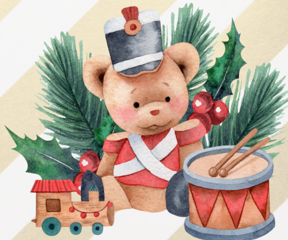
On December 20th, South Central Area Office's clerical staff and Deputy Probation Officers in the Adult CORE, SIT, Ascot, Juvenile Sealing, Supervision, Investigation, CCTP, Gang unit, Visto Volunteers, 685 Union members, and college interns also came together and donated and distributed toys to clients and community members.