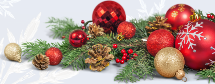
Centinela Area Office