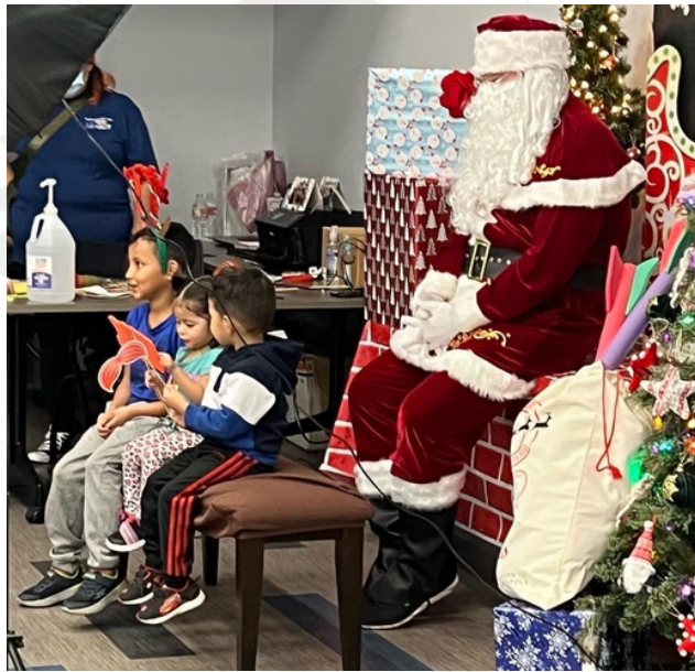
Community members taking pictures with Santa

The Pomona Valley Area office's Clerical staff and Adult CORE Deputies also adopted a family for the Holidays. They hosted a 50/50 raffle to provide a cash gift for the family and delivered toys and household essentials to them for the Holidays. The Mother expressed her gratitude to the staff for allowing her baby, who is four years old, to have a fantastic Christmas.