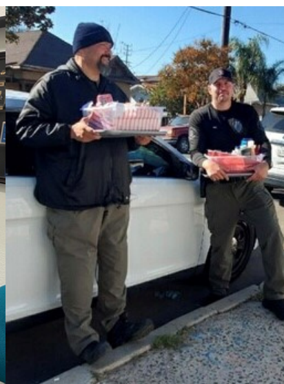
Probation SEO-Prop 63 bring on the toys