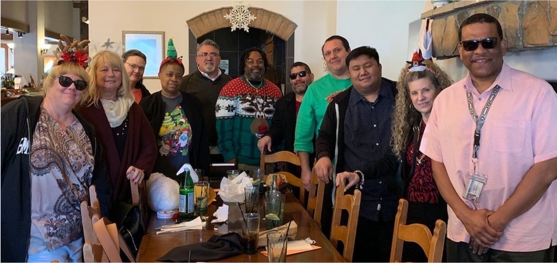
Antelope Valley and Valencia Juvenile Area Offices holiday luncheon