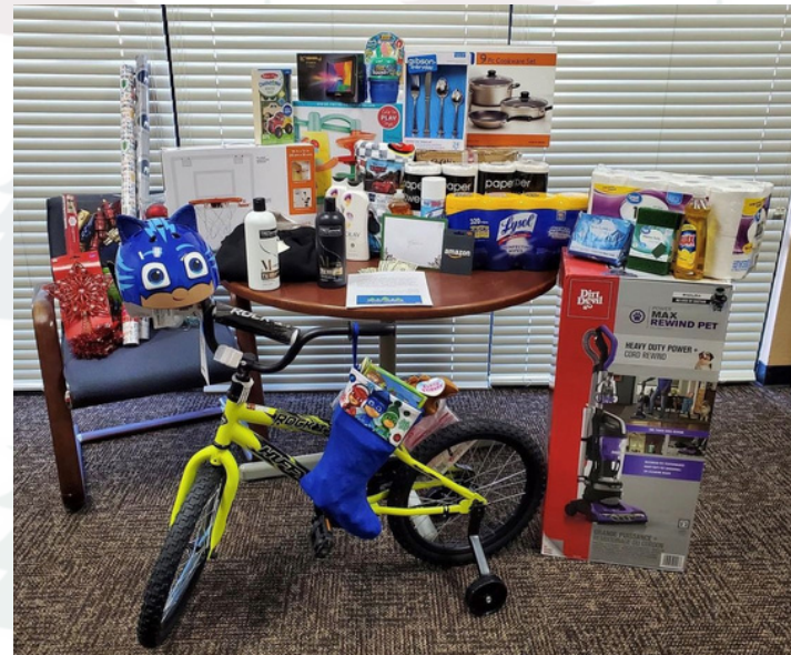
Gifts were donated for clients and community members