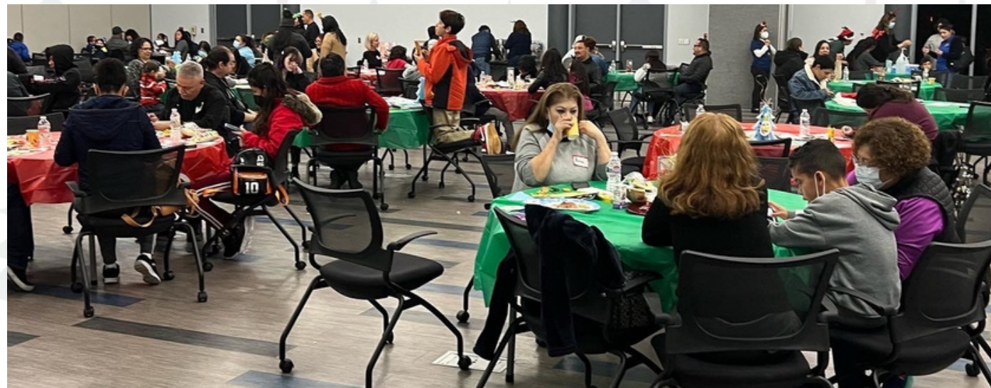
Pomona Valley Area Office Staff volunteered at Pomona Village Academy assisting at providing meals for families in need.