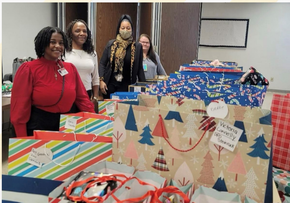
South Central Area Office Deputies organizing their Holiday toy giveaways