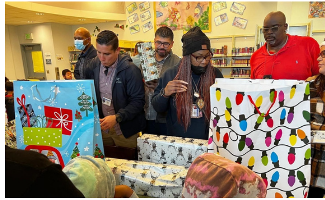
South LA AB109 DPOs go above and beyond gifting Estrella Elementary students clothing and toys for the Holidays