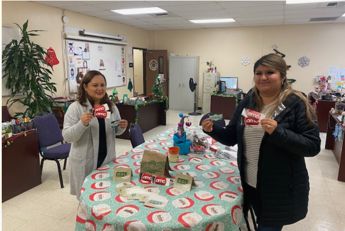
Los Angeles County Probation Department's Educational Pathway and Vocational Opportunities program (EPVO) collaborated with Soledad Enrichment Action, Inc and gave away two movie tickets to AMC theaters and a $25 dollar gift card to Wingstop to 30 youth as gift incentive for the Holidays. The youth expressed their appreciation for the support received.