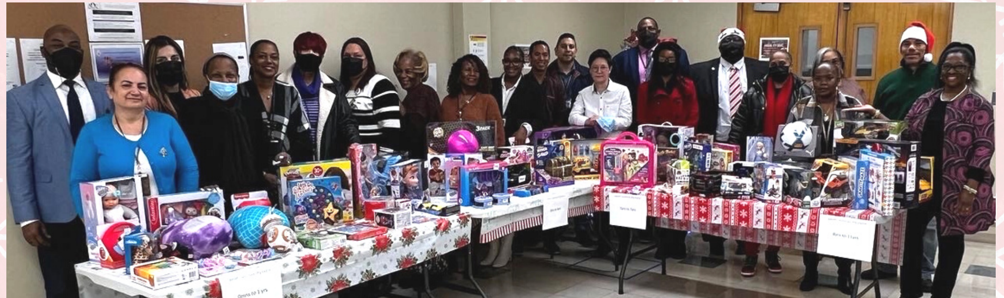
Santa Monica Area Office Holiday Toy Drive

Over the last month, Santa Monica Area Office staff and community members generously donated toys and clothing for clients assigned to the Department's Gender Specific program. As a result, 23 families were provided children's clothing and toys as they visited the office. Santa Monica Area Office intentionally focused on women and children this Holiday season. All the recipients shared their gratitude, and the children left the office smiling from ear to ear.