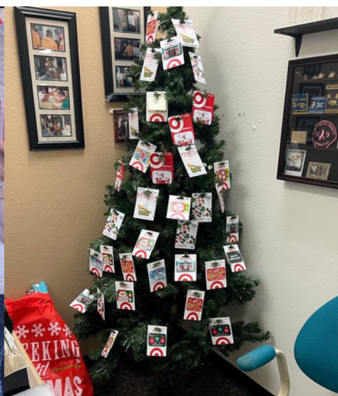
Gift cards donated by Pomona Valley Area Office Staff