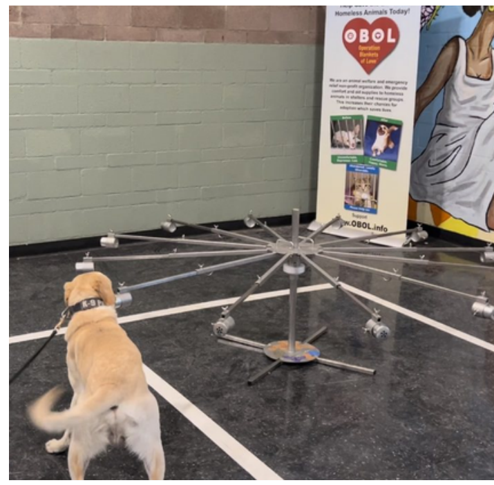
K-9 Pablo testing out the new scent wheel

"This is instrumental to the probation department and will allow us to train our dogs on a lower quantity of odor which will result in more finds in the community, it will assist in ensuring community safety overall." -SDPO Perico.