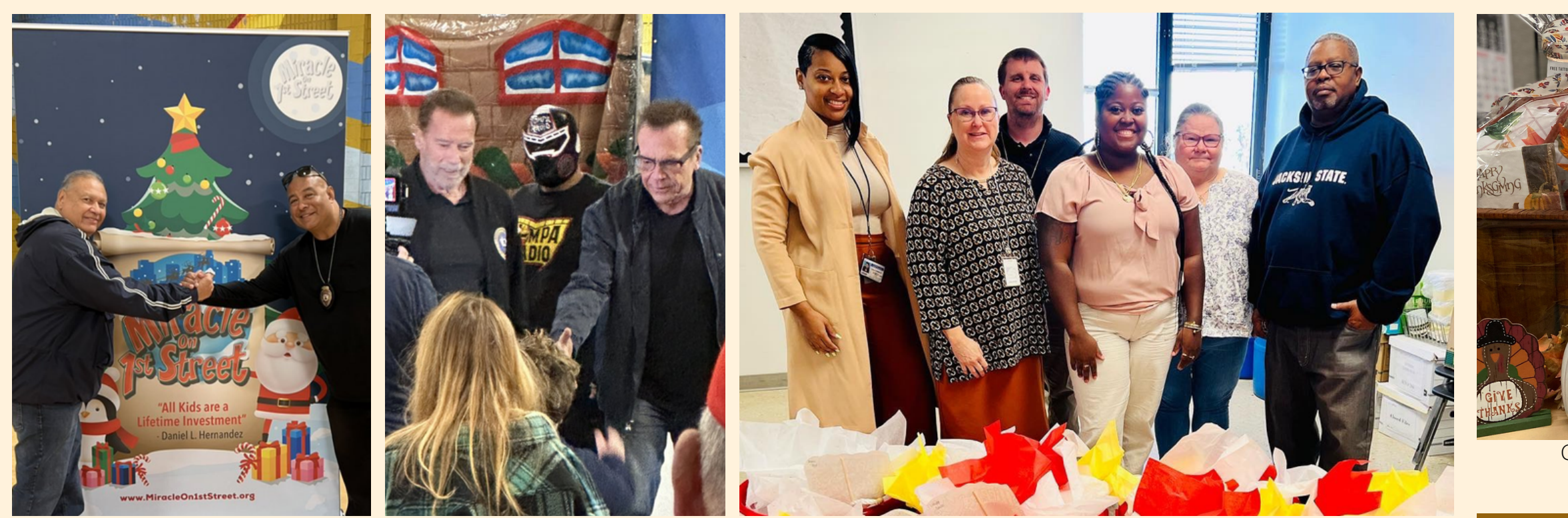
Turkey giveaway at Hollenbeck Youth Center