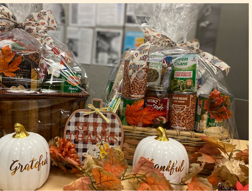
South-Central Area Office

Goodies from the San Fernando Valley regional area office AB 109 food drive