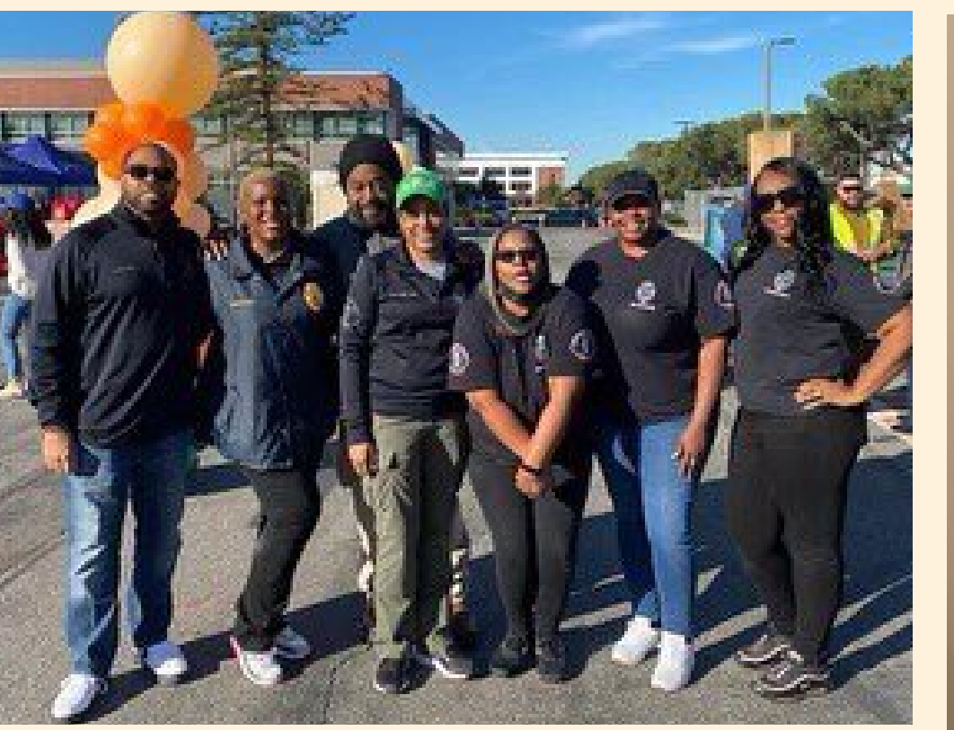
LA County Probation partnered with the Black Probation Officers Association and Alpha Kappa Alpha Sorority to participate in Senator Steven Bradford's Drive-Through Food and Turkey Giveaway at El Camino College