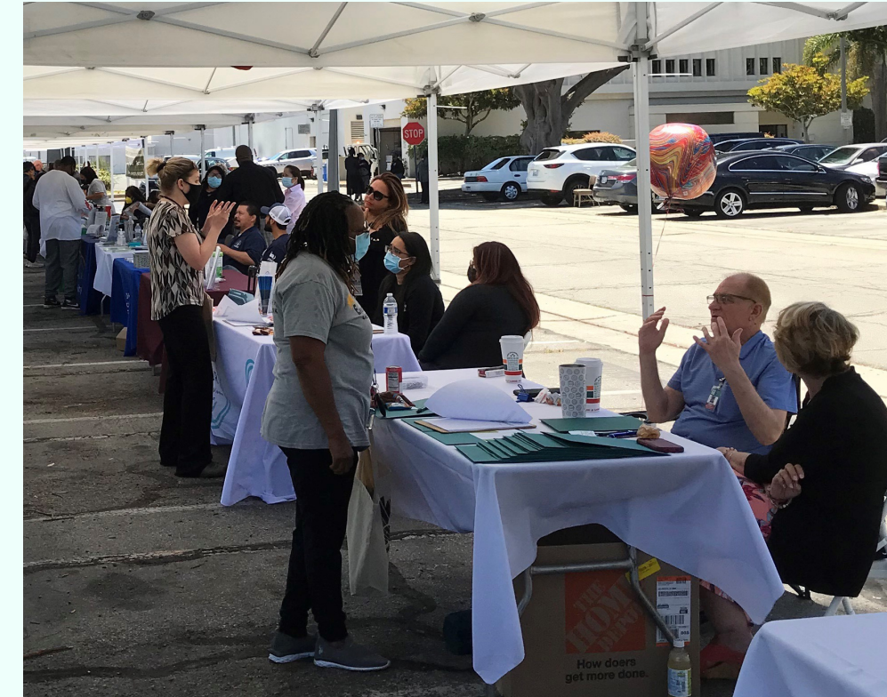
Attendees and presentors along the promenade

On Wednesday, June 1st, the department hosted the Harbor Area Office Community Resource and Job Fair. Featuring 25 participating service providers including El Camino College, DMH, the YMCA, LA County Parks and Rec, and the Harbor Occupational Center, just to name a few, the seven-hour event took place outside the Harbor Probation Area Office next to the Torrance City Hall and Courthouse.