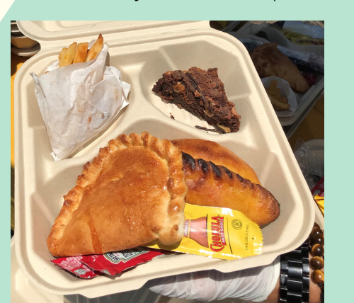
The affair was topped off by delicious Bolivian food provided by Let's Celebrate Catering