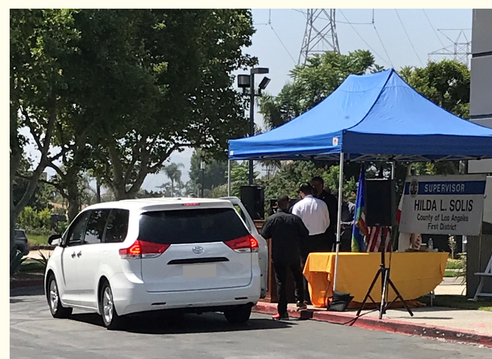
A graduate and their party pull up to the podium