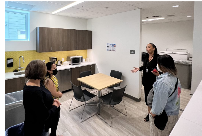
Touring the small Kitchen