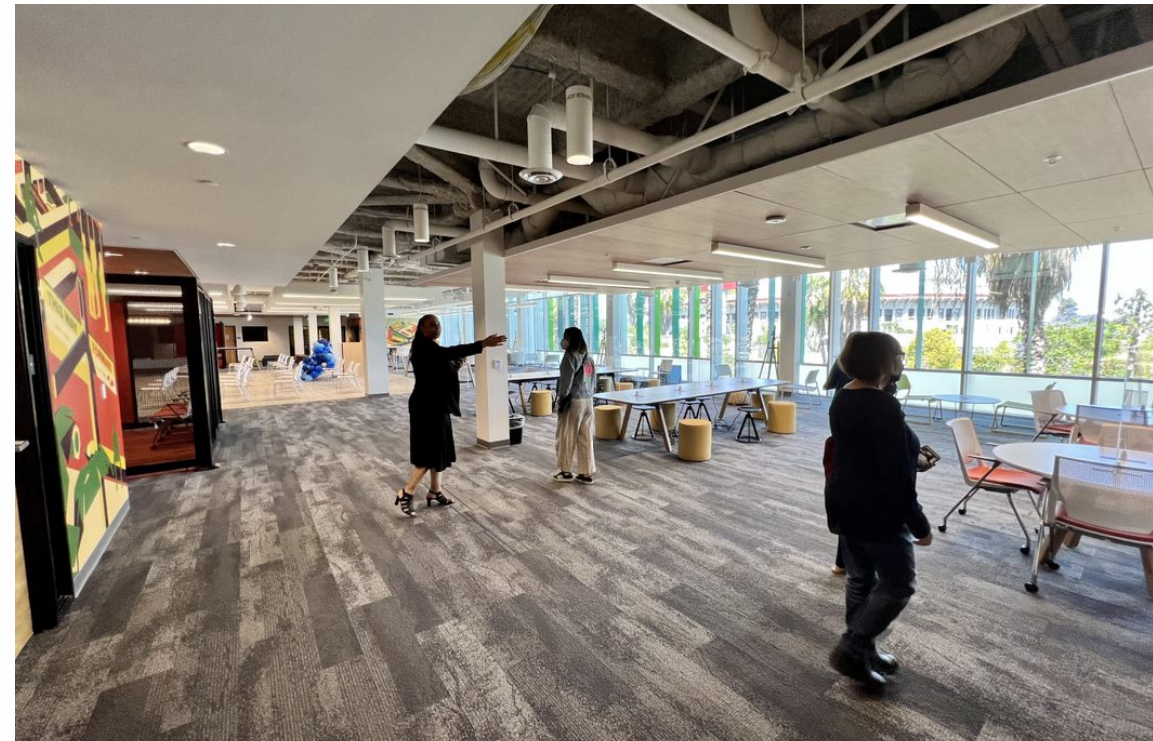
Third level floor to ceiling window wall