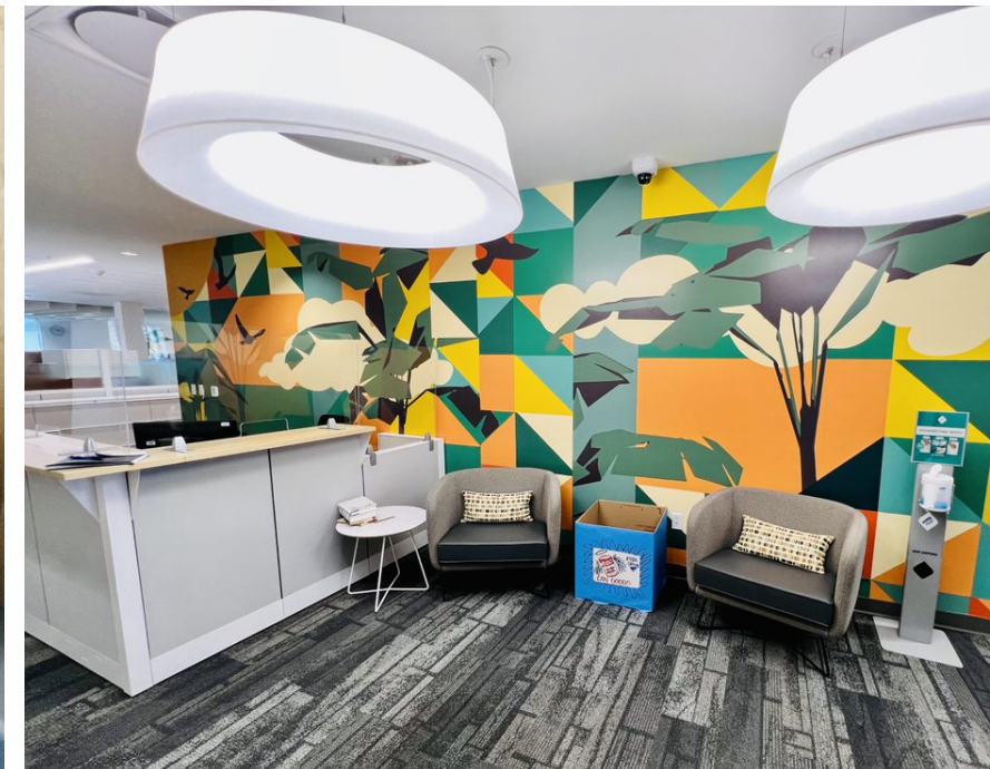
Welcoming entrance area