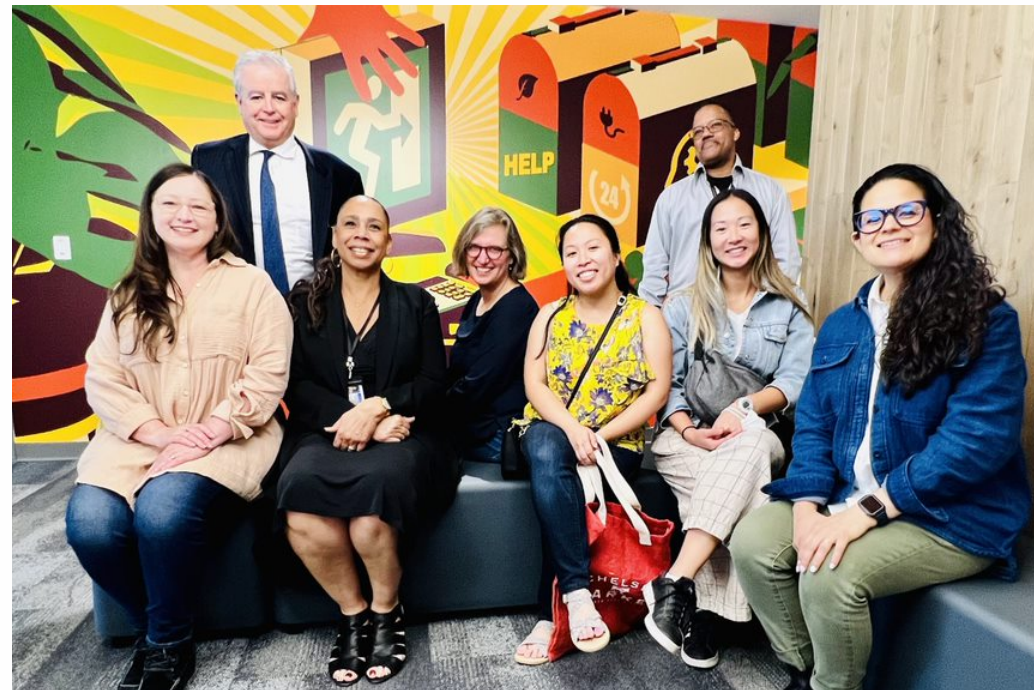
The R.O.C. Probation Staff, NAC Architecture Representative, Abbott Construction Representative, and American Institute of Architects Representatives.