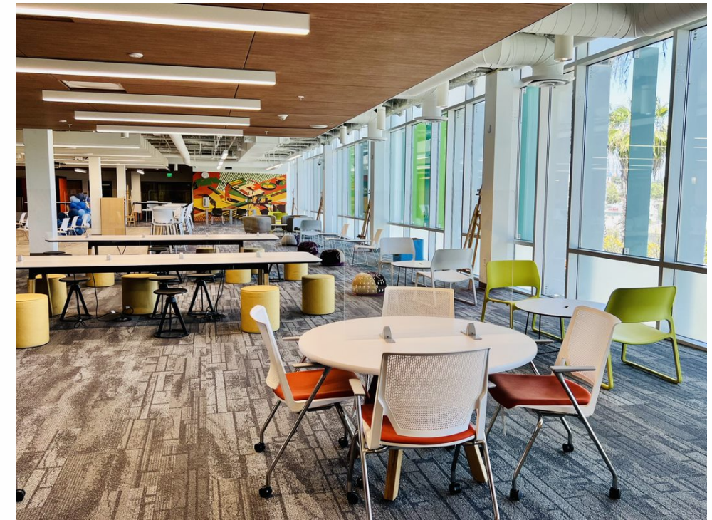
Third level meeting space