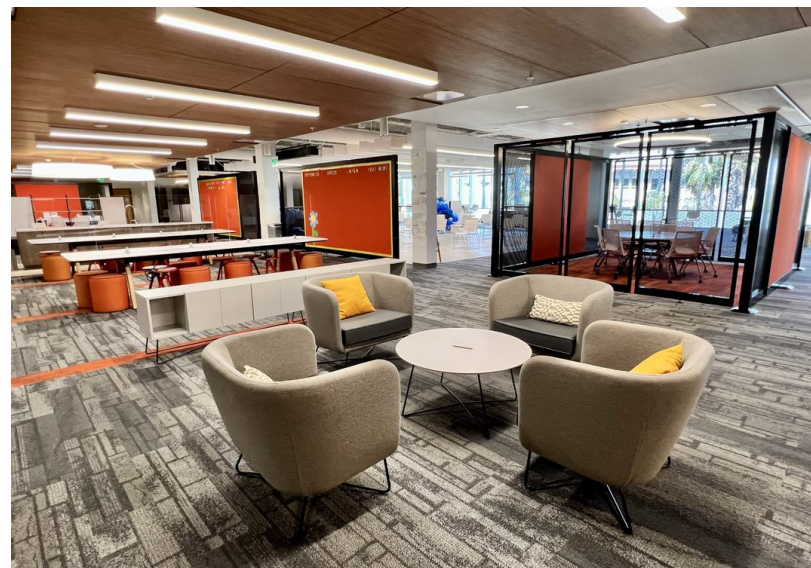
Third level open floor plan

The third floor has an open floor plan that creates a "Wow" moment upon exiting the elevator. Although several walls are painted in various combinations of bright orange, yellow and green, the main attention grabber on this level is the floor-to-ceiling window wall that invites a plethora of natural sunlight. This floor also features beautiful murals covered with inspirational words, numerous cozy and comfortable seating areas, a children's corner with toys, a computer lab, several private therapy offices, a large conference room and kitchen, a community clothing pantry, and several cubicles for service providers to utilize while meeting with clients and community members.