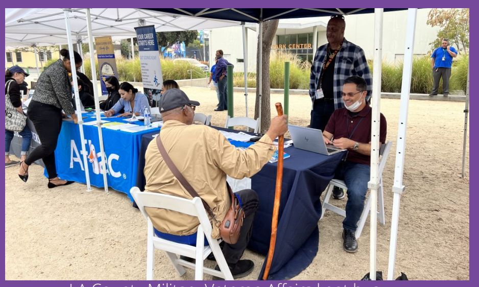
LA County Military Veteran Affairs kept busy

"Today is amazing! If people took time to get to know probation and see what they are truly trying to do, then changes can be made, and healing can begin to happen."