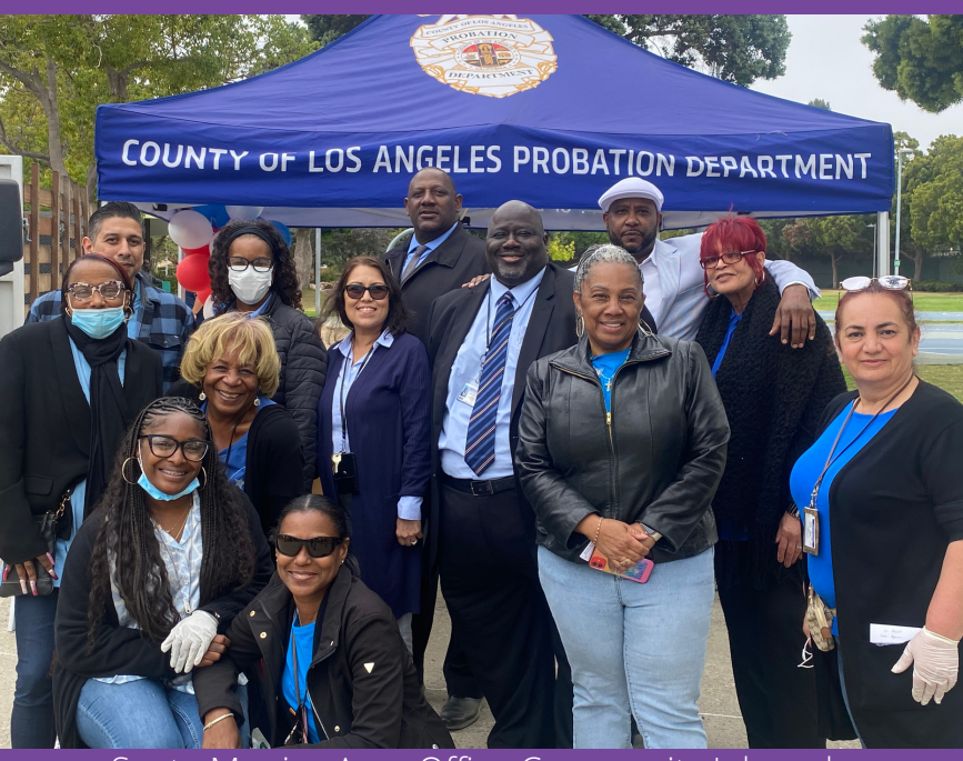
Santa Monica Area Office Community Job and Resource Fair Volunteers.