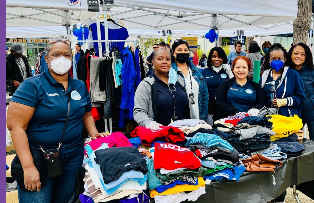
Mental Health Housing Court Program Unit