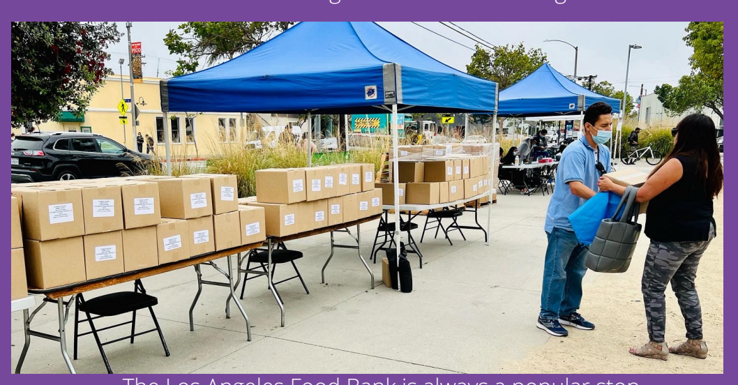
The Los Angeles Food Bank is always a popular stop