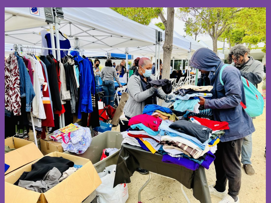
The Mental Health Housing Court offered clothing distribution