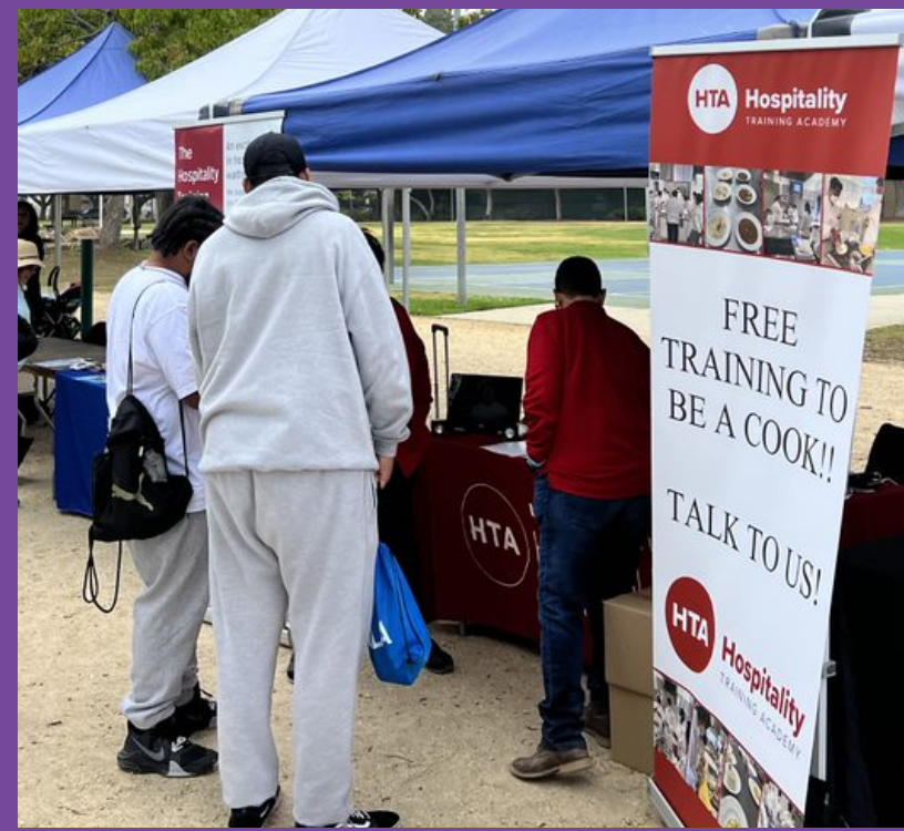
Opportunities included free chef training