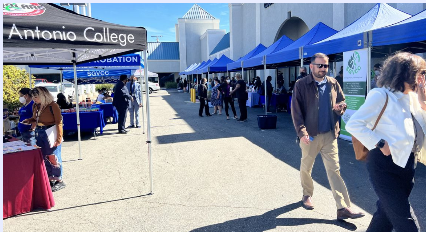
The promenade at the Pomona Valley Area Community Resource Fair