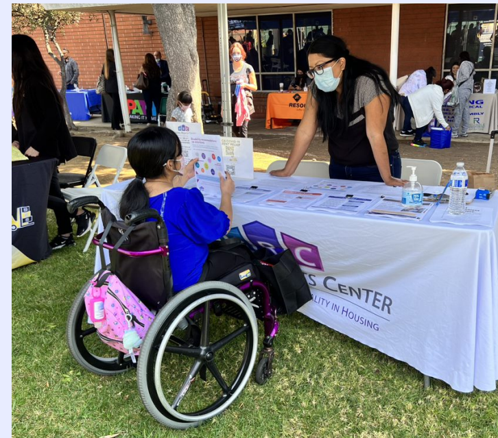
The Housing Rights Center at the East LA Job and Resource Fair