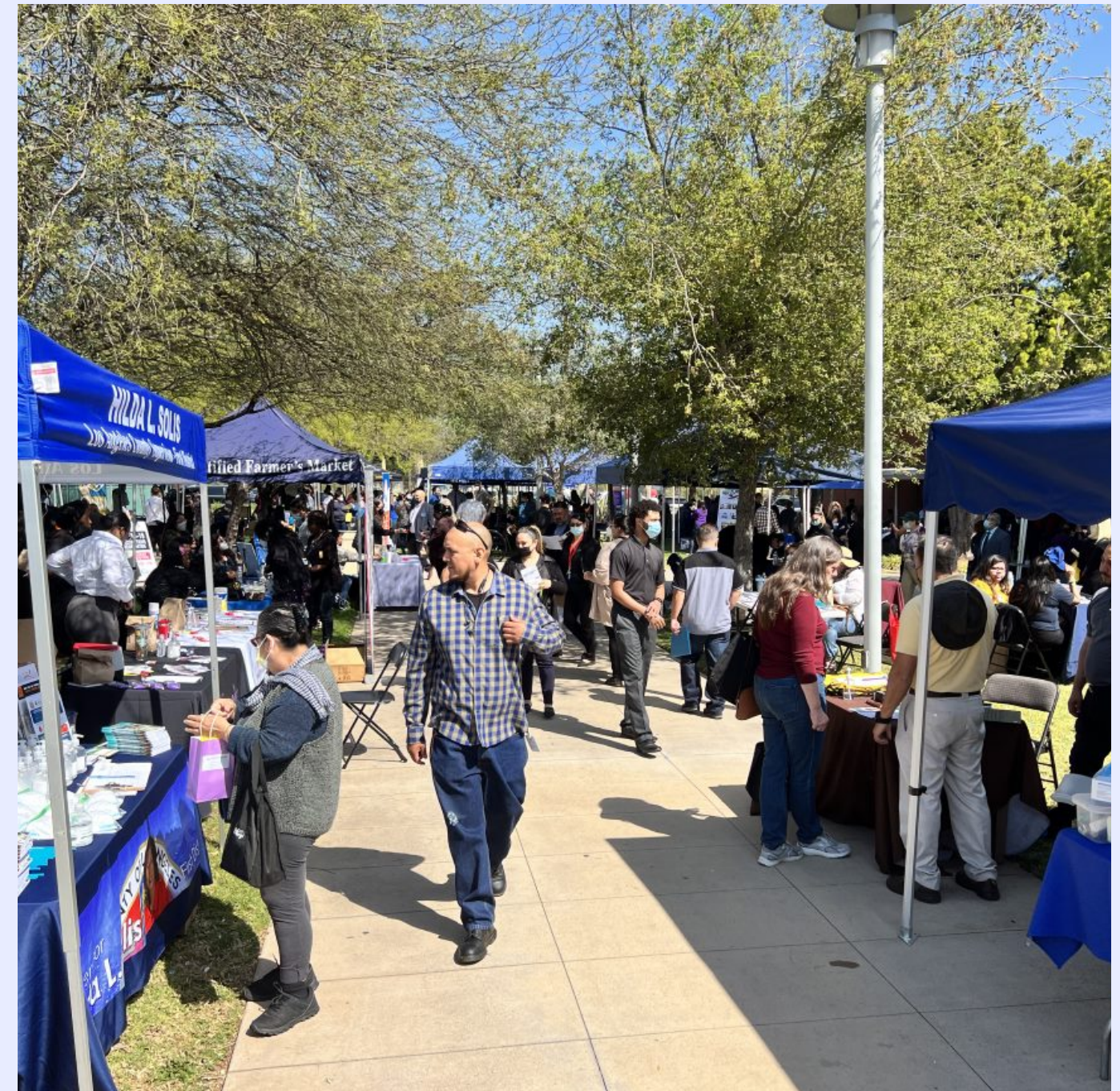
Lots to see and learn about at the East Los Angeles Job and Resource Fair