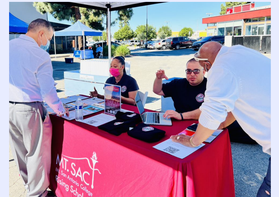
Mt. Sac Rising Scholars Program offered some good scholarly advice at Pomona Valley Resource Fair