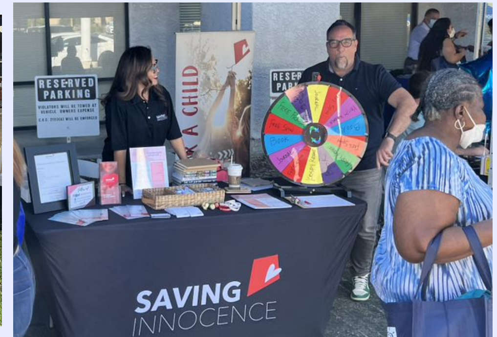
Saving Innocence at the Pomona Valley Resource Fair