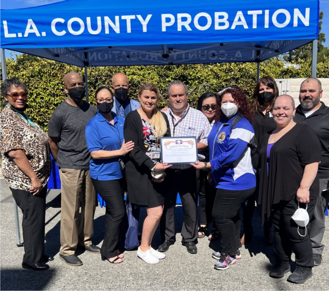
Pomona Valley Area Office Community Resource Fair Planning Committee