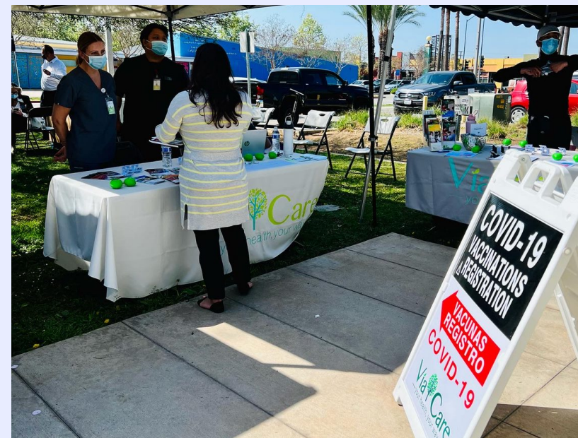
Via Care Vaccination Clinic was getting the job done at East LA Job and Resource Fair